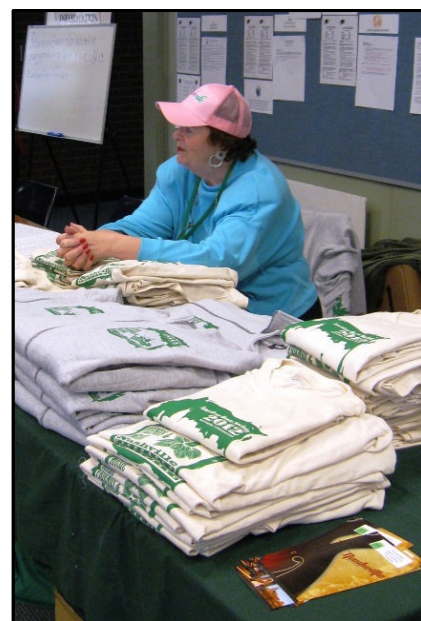
T-shirts and sweatshirts on sale at Hosta College for the upcoming 2012 AHS National Convention in Nashville, TN.