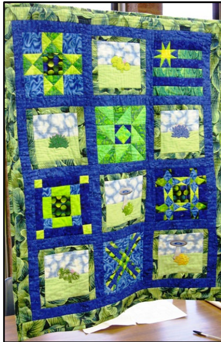
Great Lakes Region quilt raffled at Hosta College.