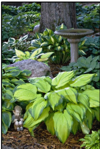
Hosta 'On Stage' - front and center.