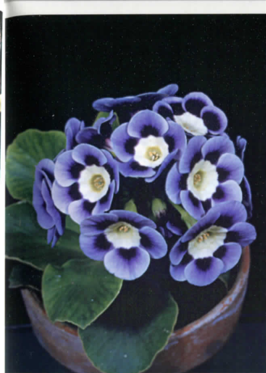
P. auricula alpine hybrid seedling