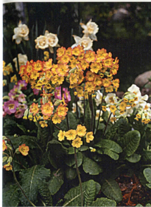
P. veris