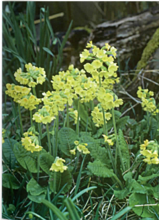
P. elatior APS File photo