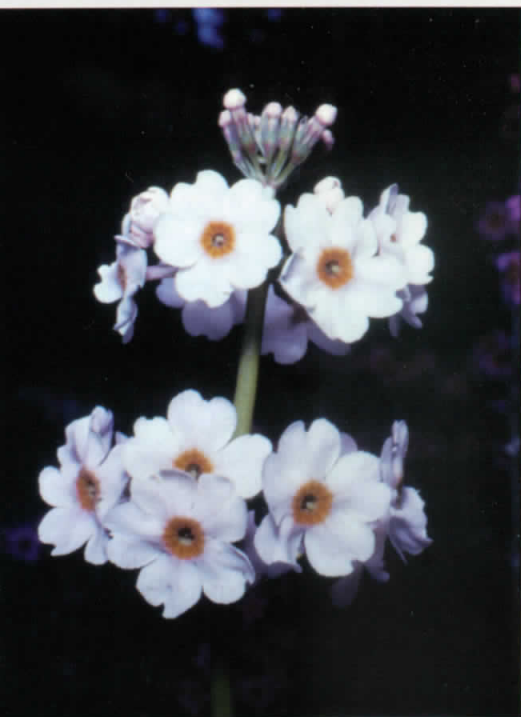
P. japonica white