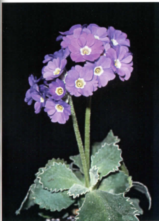
P. marginata 'Linda Pope'.