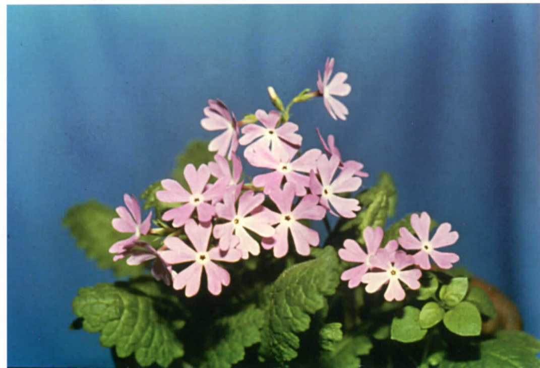
Wild collected P. sieboldii, Fukushima Japan.