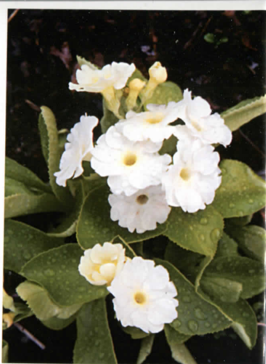
P. auricula garden hybrid