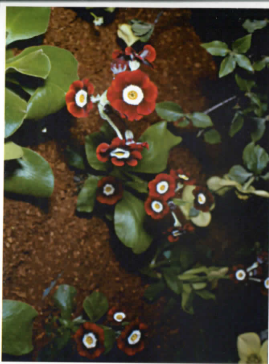
P. auricula garden hybrid 'Dales Red'