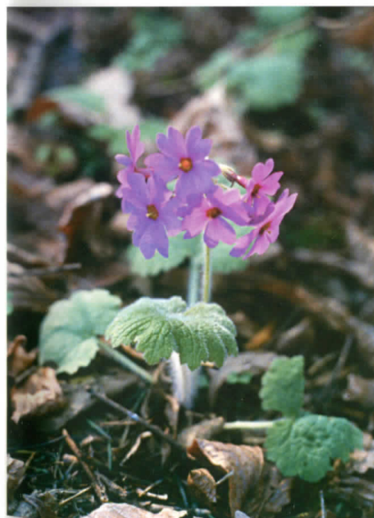
P. kisoana Berry Botanical Garden