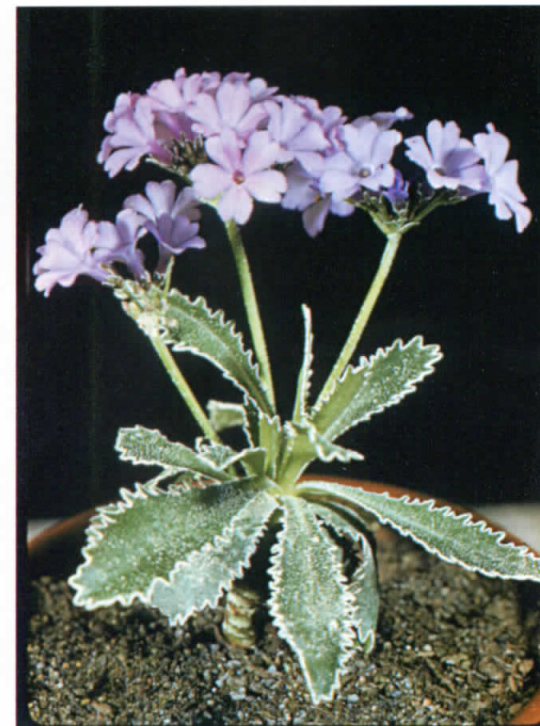
P. marginata 'Ivy Agee'.