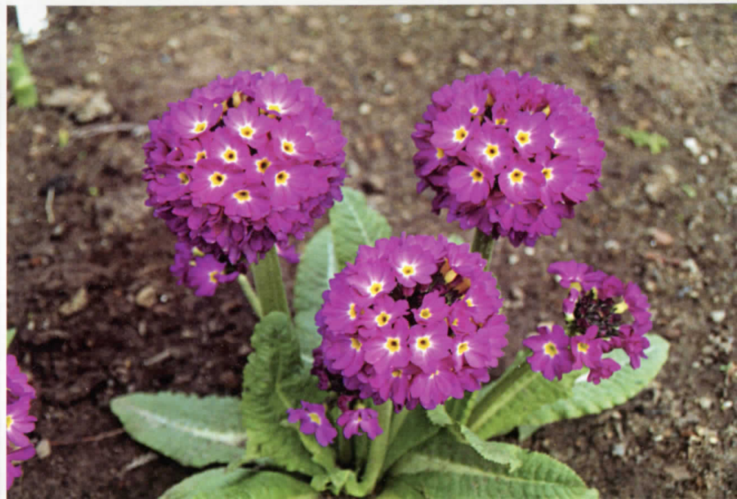
Primula denticulata 'rubra'.