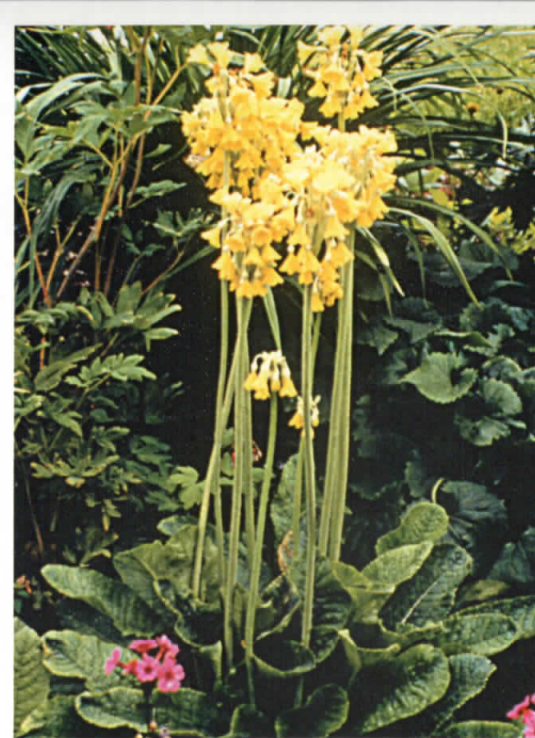
P. florindae