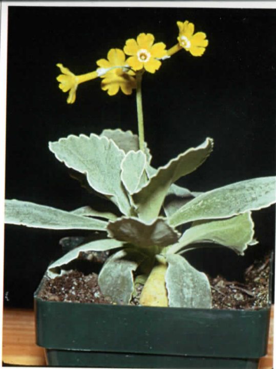
P. auricula species