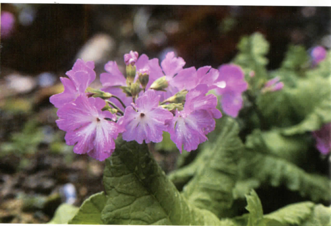
P. sieboldii, 'Thelma'

"Primroses are wonderful flowers with so wide a selection of species and hybrids that you can grow some type of primrose any place in the world where water is available for the cultivation of plants. If you tell other people about primroses they become interested. If you explain the benefits of membership in the APS to these interested people you will get new members. In this hectic atomic world of today, time and money are at a premium. Do not sell primroses and the APS short. They both offer high returns for the time and money expended."