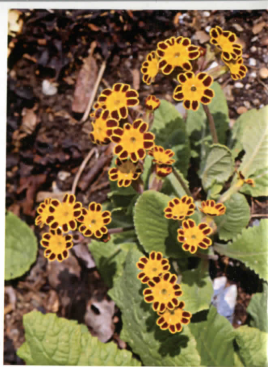
Polyanthus Primrose 'Gold Laced Polyanthus' grown and photo in the garden of John O'Brien, Juneau, Alaska