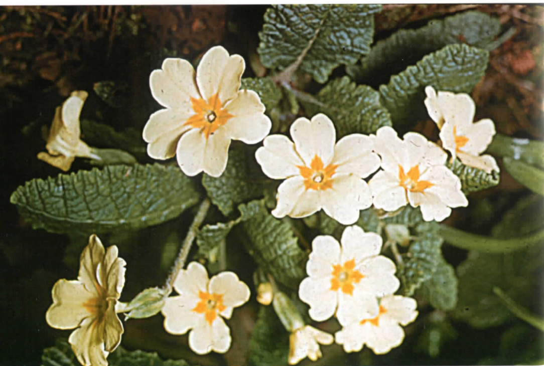
Primula vulgaris .