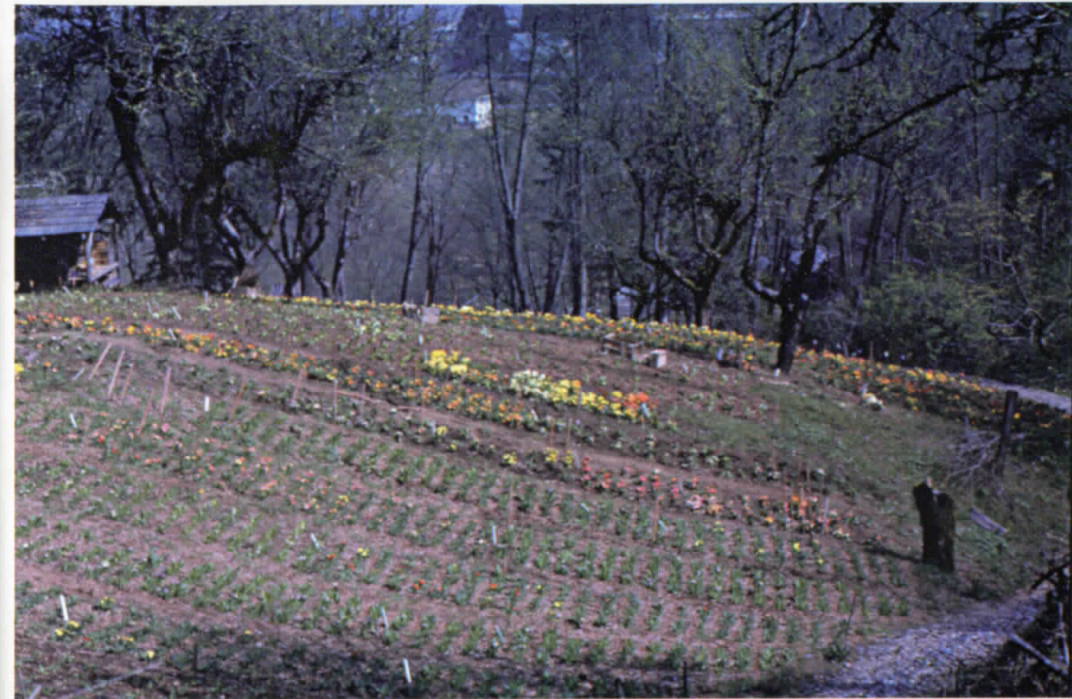
Barnhaven Gardens 'On the Hill' Gresham, Oregon 1962.

Photo right: P. Pruhoniciana 'Dorothy' (left & center); Unnamed hybrid deep pink (center); P. x P. 'Millicent' pink (right front); P. x P. 'Purpurkissen' purple (upper right); P. x garryard 'Guinivere' seedling with bronze foliage (top, right of center); unnamed hybrid deep pink (top right).