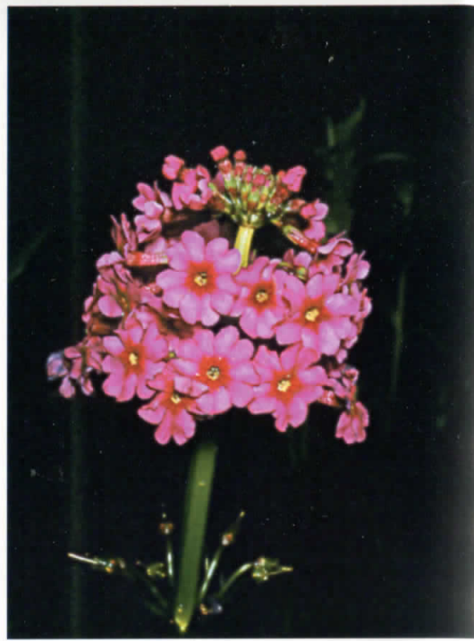
P. japonica red