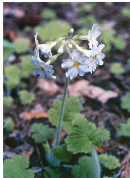
P. kisoana 'alba', Rhododendron Species Foundation Garden, Ed Buyarski photo