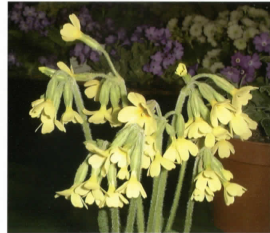
P. elatior