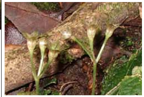
The seed capsules of Primula chapaensis are unique in the genus. They are curious, like little pod with caps, or lids, which are sometimes also seen in moss seed capsules