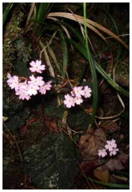
Primula of Viet Nam found in a very wet habitat on Mt. Fan Si Phan near Sapa in Lau Cai Province.