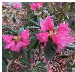
Rhododendron 'Lee's Scarlet'

Rhododendrons are best known as spring-blooming shrubs, but a number of species of this large genus do produce flowers in winter or early spring. These include R. barbatum , R. dauricum , R. lanigerum , R. moupinense , R. mucronulatum , R. pemakoense , R. praevernum and R. strigillosum . A number of early-blooming cultivars have been selected from these species, and many hybrids have been produced. Bloom time is dependent on winter temperatures, and quality of the blooms can be affected by freezes or heavy rain. But under favorable conditions these are spectacular additions to the winter garden. One of the best known is 'Christmas Cheer', which produces trusses of pale pink flowers in February, while 'Lee's Scarlet' produces trusses of red flowers starting in late January.