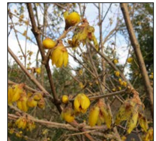
Flowers of wintersweet

Chimonanthus is a genus of evergreen or deciduous shrubs native to China that are grown for their fragrant flowers. C. praecox is the most commonly grown species in the genus, forming an upright, multi-stemmed coarse-textured shrub. The common name wintersweet refers to the exceptionally fragrant yellow flowers, which dangle from the bare branches throughout January. The scent of the flowers may carry far from the plant on warm winter days. The flowers are waxy and hang downward on the branches, so they are undeterred by rain and it is not unusual for this plant to flower even during periods of snow. Wintersweet is one of the most fragrant plants for the winter garden.