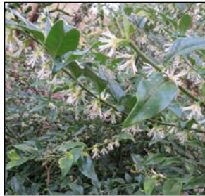
Sweet box flowers

Sweet box refers to one of several evergreen shrubs with fragrant flowers native to China and the Himalayas. The species in cultivation vary somewhat in height, but all spread by suckers to form dense evergreen thickets. S. hookeriana (especially S. hookeriana var. humilis ) is taller (to 4 feet) and spreads vigorously, whereas S. confusa and S. ruscifolia grow to perhaps 2 feet and are clumpers that send up more shoots but do not spread. In January, diminutive white flowers are produced along the stems. Sweet box is monoecious, meaning that separate male and female flowers are mingled on the stems and partly hidden by the foliage. Although the flowers are not particularly showy, they are highly fragrant and the scent can be detected at a distance. These are some of the most commonly grown winter-blooming shrubs and are especially useful as a tall groundcover in shady situations.