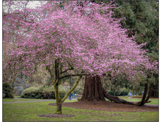
Higan cherry in full bloom

Cultivars: L. x purpusii 'Winter Beauty'.