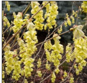
Winter hazel flowers

About six species of this Asian native can be found at nurseries. Bloom and plant size vary. Most species are large deciduous shrubs, and some can be developed into small trees. In early spring pendent clusters of small, lemon-yellow flowers dangle on bare branches. Branches form a zigzag pattern, which adds to the architectural beauty of this plant. The flowers are fragrant and attractive to pollinators.