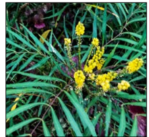
Flowers of M. eurybracteata

This evergreen shrub is native to China and is distinctive due to its narrow and smooth-edged leaves, separating it from some of the other spiny-leaved Mahonias. The foliage can appear tropical with the fine texture of the leaves. This plant prefers partial to full shade. In late fall this shrub sends up bold spikes of yellow flowers that attract bees. Silver-blue berries follow later in winter.