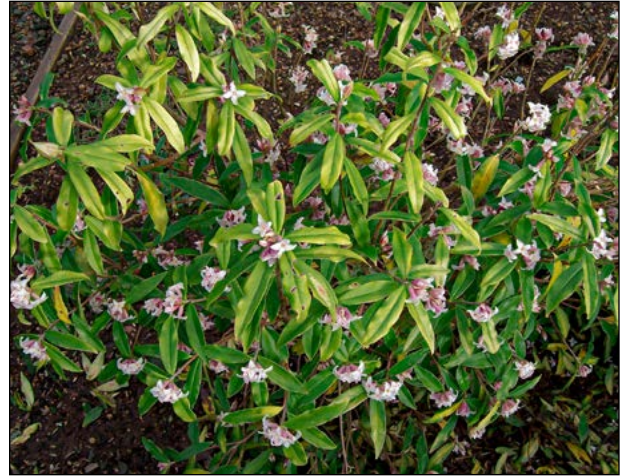
Paper Daphne in bloom

Cultivars: 'Burgundy Lace', 'Red Dragon'.