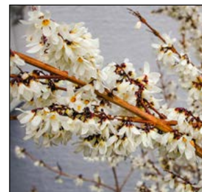
White forsythia flowers

White forsythia is a relative of the later-flowering common forsythia. It is a small, multistemmed shrub, native to the mountains of Korea, where it is becoming rare. The plant has an arching habit, becoming a shrub that is wider than tall. White flowers tinged with pink are produced on the bare stems in mid-February. The flowers are fragrant but are sensitive to hard frosts, so positioning the plant against a warm wall or with other protection is best. Because it produces long canes, it also makes a good candidate for espalier.