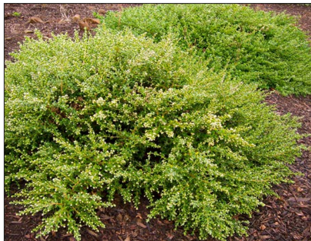
Baccharis pilularis 'Twin Peaks'