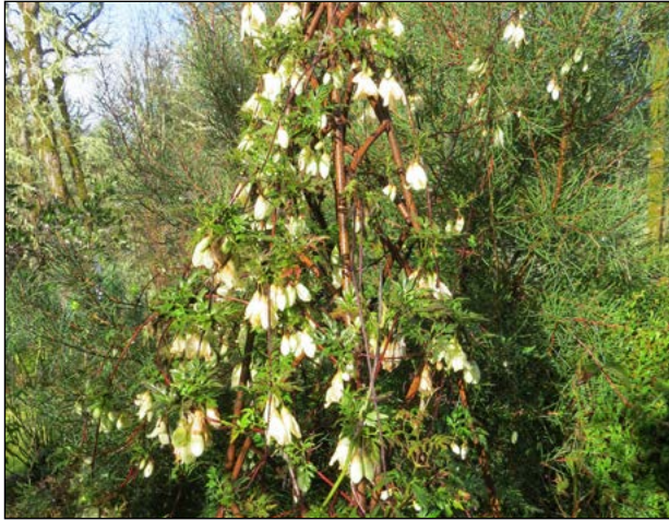
Clematis cirrhosa in bloom