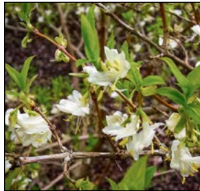
Winter honeysuckle flowers

L. standishii and L. fragrantissimum are large, multistemmed shrubs that are native to China. L. x purpusii is a hybrid between the two species and is also a large, semievergreen shrub. All these plants form upright, arching plants in the garden. Flowers are small and white and produced along mostly bare branches. Winter honeysuckle is not particularly showy in bloom, but the flowers are highly fragrant.