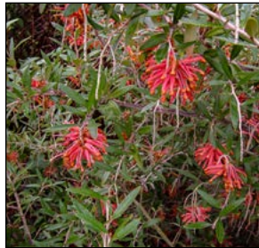
Royal grevillea flowers

Royal grevillea is a fast-growing evergreen shrub native to southeastern Australia. It forms a large, rounded shrub, with foliage that is an attractive olive-green above and silvery below. The flowers are orange-red in color and are borne in pendant clusters whose unique appearance sometimes gives the plant the common name of “spider plant.” Royal grevillea has a long bloom period, which extends from midwinter into early spring. Even in bud the flowers are showy, and once open they attract overwintering hummingbirds as well as bees.