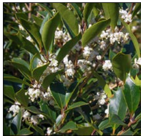
Holly tea tree flowers

Holly osmanthus is one of several fall-flowering Osmanthus, but O. heterophyllus is the hardiest, most commonly grown species. It is a native of Japan, where it forms a dense, upright oval shrub. The leaves are shiny dark green. Juvenile leaves are notably spiny while adult leaves — produced near the top of the plant — lack spines. Mature plants may consist primarily of smooth leaves. The flowers are small, white and borne in groups of four to five in leaf axils. Although this plant is not conspicuous in bloom, the flowers are highly fragrant and the scent can be detected from many feet away on warm fall days.