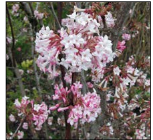
Viburnum x bodnantense flowers

This deciduous viburnum is a hybrid of V. farreri and V. grandiflorum , which was raised at Bodnant Gardens in Wales around 1935. It develops into a tall, upright multistemmed shrub whose foliage emerges bronze in spring before becoming dark green. Flowers are pink and borne in 2- to 3-inch-wide heads on bare branches in midwinter to early spring. The flowers are fragrant, but open flowers are susceptible to frost and wet weather. The long bloom period means that some flowers escape damage to perfume the garden.