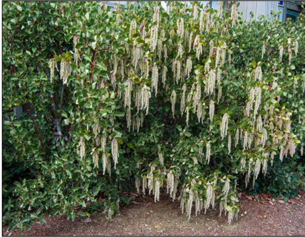
Silk tassel in bloom