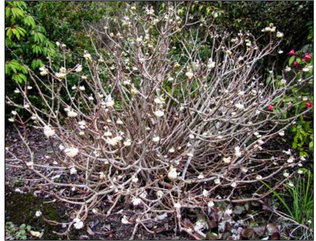
Paper bush in bloom

Cultivars: ‘Aurea’, ‘Golden Glory’, ‘Variegata’. Other forms have been selected for fruit qualities like ‘Elegant’, ‘Exotica’, ‘Pioneer’, ‘Red Star’, ‘Sunrise’, etc.