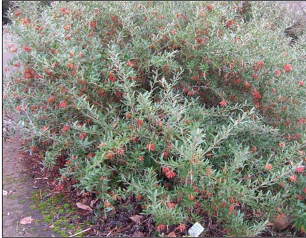
Royal grevillea in bloom