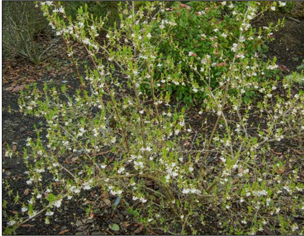
Winter honeysuckle in full bloom