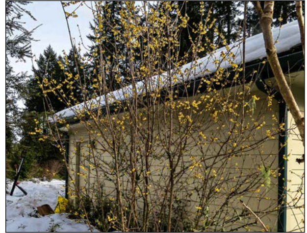
Wintersweet in bloom