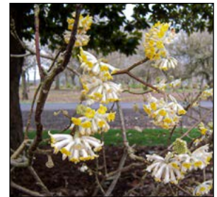
Paper bush flowers

Chinese paper bush often is an item in collectors’ gardens for good reason. This shrub has sunny yellow or even orange-to-red late-winter blooms which are also fragrant. The blooms are borne in drooping silvery clusters and begin to form in late summer, making them attractive throughout the winter prior to opening. Individual flowers may begin to open in January. In full bloom, clusters of tubular flowers hang from bare stems. This plant is also attractive in the growing season, with long (to 5 inches) dark green leaves, which can give a tropical feel. Paper bush is susceptible to winter freezes and is best placed in a protected location.