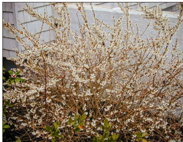
White forsythia in bloom

Cultivars: 'Christmas Cheer', 'Etta Burroughs', 'Harry Carter', 'Lee's Scarlet', Nobleum Group (Album, Coccineum, Venustum), 'Seta', 'Snow Lady', 'Peter Faulk', 'Pink Snowflakes', 'Praecox', 'Rosa Mundi'.