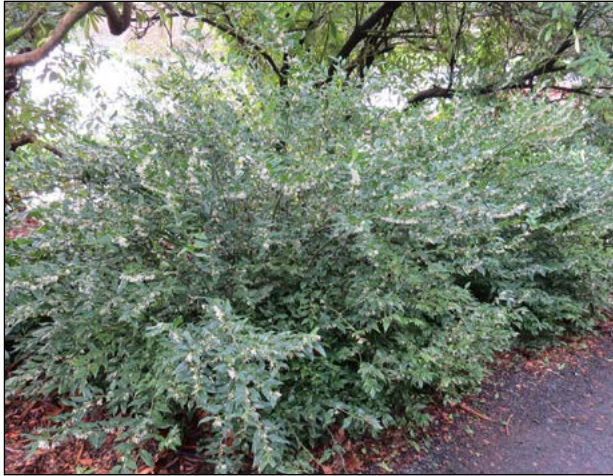
Sweet blox in full bloom