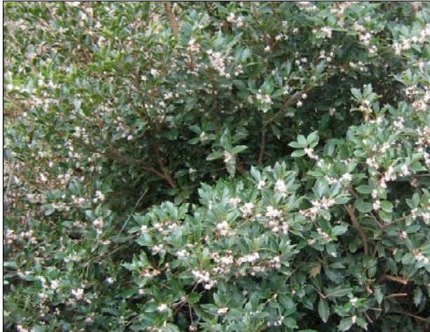
Holly tea tree in bloom