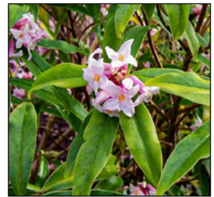
Paper daphne blooms

This Daphne is native to lower elevations of the eastern Himalayas, where historically the bark was used to make paper. In the garden it forms an upright shrub to 8 feet tall in favorable locations, with an open habit. Leaves are narrow and medium green and may be evergreen or deciduous, depending on cultivar and also on winter temperatures. The flowers are small, pinkish-white and borne in clusters at the shoot tips in January or February. As with other Daphne, the flowers are highly fragrant and the scent may carry a considerable distance on a warm winter day. The species is somewhat tender and is best placed in a protected location.