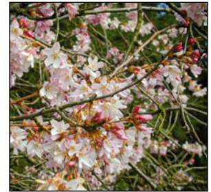
Higan cherry flowers

Higan cherry is a variable species native to Japan. Most cultivated forms are spring-blooming small trees with a weeping habit. 'Autumnalis' and 'Autumnalis Rosea' are two cultivars that have an upright habit and will flower sporadically in fall and winter when temperatures are warm, followed by a flush of flowers in early spring. Flowers on 'Autumnalis' are semidouble and light pink, while those of 'Autumnalis Rosea' are deeper pink.