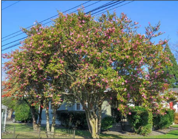
Mature tree form of Camellia sasanqua in bloom