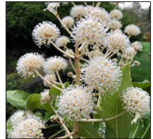
Japanese fatsia flowers

Japanese fatsia is native to Japan and South Korea, where it occurs as a modest-sized upright shrub in woodlands. The leaves are large, dark green and conspicuously lobed, which gives the plant a tropical appearance in the landscape. The flowers are white and produced in spherical clusters about the size of a golf ball, which are borne in large panicles above the foliage. The flower display is unique, but they are sensitive to cold, and a hard freeze usually brings flowering to an end. Some variegated cultivars are available. This unusual shrub is suitable for protected, shady spots in the landscape where the flowers might be better protected from cold.