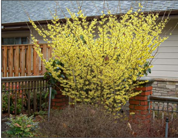
Yellow-flowered witchhazel in full bloom