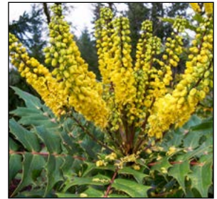
Mahonia x media flower cluster

This plant is a hybrid of M. japonica and M. lomariifolia , which are native to Japan and Southeast Asia, respectively. Like the parents, M. x media forms a tall, broad, texturally striking plant as a result of the large, compound leaves, which are over 12 inches long and composed of 15 or more leaflets. In January, the shrub produces 12-inch erect vase-shaped spikes of bright yellow flowers at the shoot tips. In bloom the plants are showy and highly attractive to European honeybees on warm winter days. The flowers open sequentially along each spike, and so flowering persists for about a month. The flowers are often followed by clusters of blue fruit.