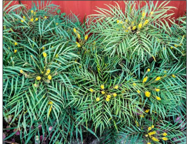
Mahonia eurybracteata in bloom

Cultivars: 'Purpureus', 'Goshiki', 'Rotundifolius', 'Gulftide', 'Variegatus', 'Ogon', 'Sasaba'.