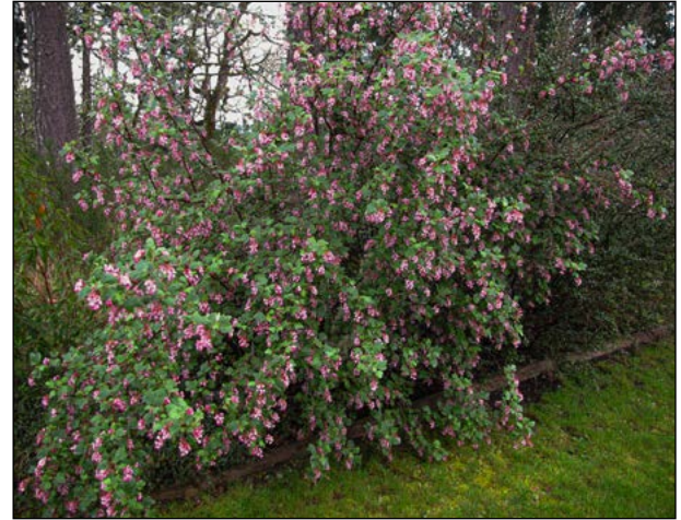
Chaparral currant in bloom