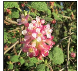
Flowers of chaparral currant

Chaparral currant is a native of California that is related to the spring-blooming Pacific Northwest native flowering currant, R. sanguineum . It has a distinctly upright habit and produces leaves and shoots that are noticeably aromatic. It is drought tolerant and will lose its leaves in summer, going almost totally deciduous. This characteristic does take some getting used to. With the onset of rain in fall it begins leafing out and flowering. Although not as showy as flowering currant, it produces clusters of pink flowers from mid-December through April. The flowers attract overwintering hummingbirds as well as longer-tongued bees, particularly early emerging bumblebee queens on warm January and February days.