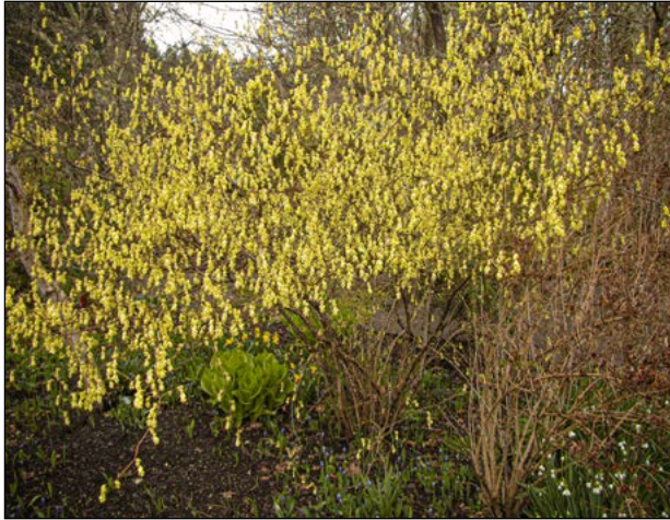
Winter hazel in full bloom