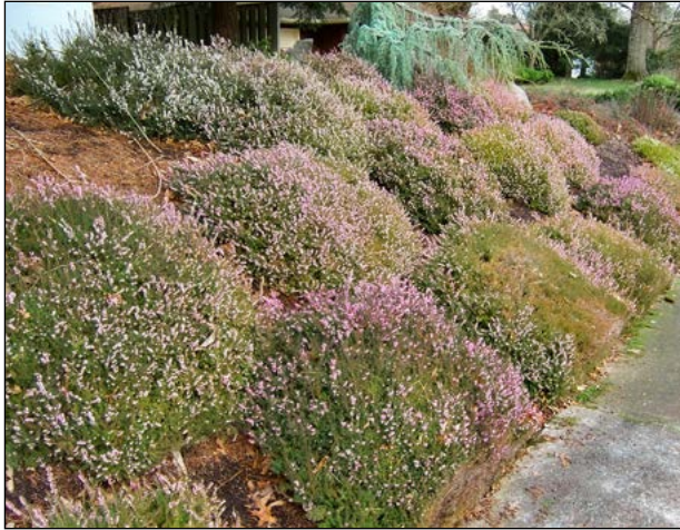
Groundcover of winter heath in bloom