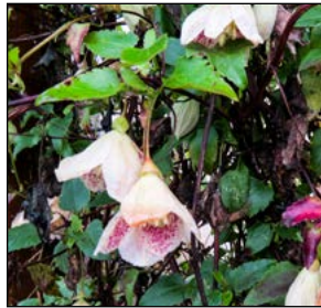
Clematis cirrhosa var. purpurascens 'Freckles'

This species is native to the Mediterranean basin in southern Europe and North Africa. This evergreen vine produces thin stems with paired trifoliate compound leaves. The stems also have tendrils that enable it to adhere and climb a trellis or the foliage and stems of nearby plants. In late fall and winter, clusters of cream-colored, pendulous flowers are produced. There are two recognized varieties of the species. C. cirrhosa var. balearica is from the western Mediterranean island of Menorca and features finely cut foliage and lemon-scented flowers. In the variety C. cirrhosa var. purpurascens , the flower petals are prominently speckled with purple markings.