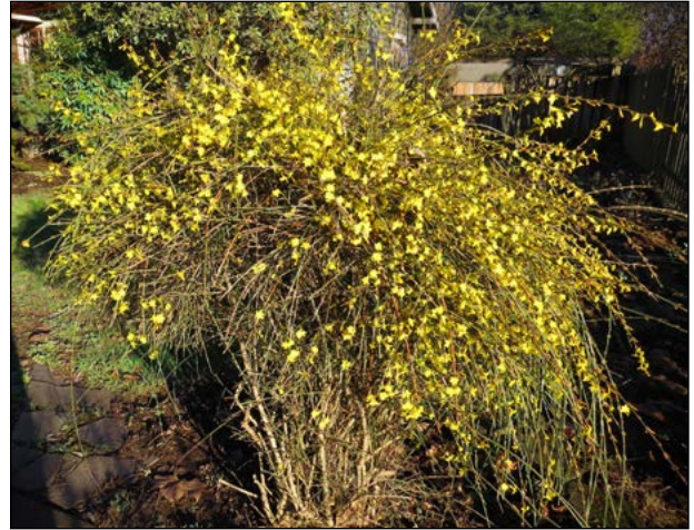
Winter jasmine trained as a standard

Cultivars: 'Wisley Cream', C. cirrhosa var. purpurascens 'Freckles', 'Jingle Bells'.