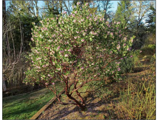
Actostaphylos 'Austin Griffiths'

Cultivars: G. elliptica : 'Evie', 'James Roof'. G. x issaquahensis : 'Glasnevin Wine', 'Pat Ballard'