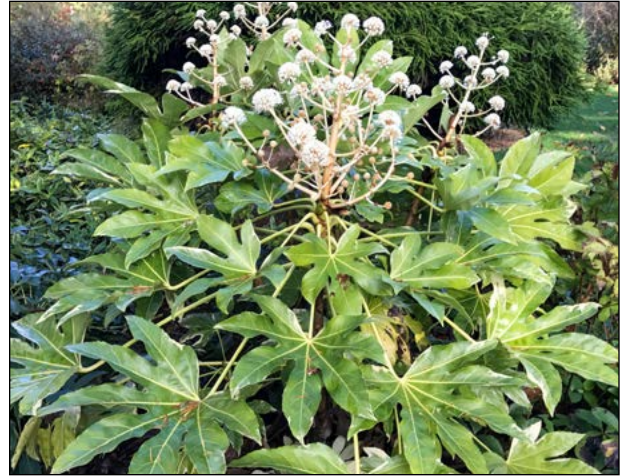
Fatsia japonica 'Variegata'

Cultivars: 'Elfin King', 'Compacta', 'Oktoberfest'.