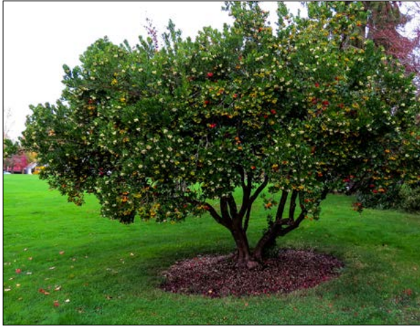
Mature strawberry tree