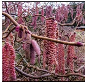
C. avellana 'Red Dragon'

European hazelnut is widely cultivated in the Willamette Valley and is familiar for its pendulous yellow catkins, which are produced in January. The lesser-known native hazel, Corylus californica , is found in central and western Oregon and is also winter-blooming. Of the ornamental forms of hazel, the oldest is C. avellana 'Contorta', a green-leaved shrub with twisted branches and twigs that blooms in January. However, it is susceptible to eastern filbert blight, the major disease problem on European hazelnut. Fortunately, Oregon State University recently introduced two cultivars resistant to Eastern filbert blight, both of which have purple foliage that fades to green during the growing season. 'Red Dragon' has twisted stems and purple catkins. 'Burgundy Lace' has upright growth and an unusual leaf shape that resembles a Japanese maple and purple catkins. 'Burgundy Lace' also produces edible nuts.