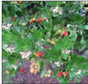
Strawberry tree flowers and fruit

Strawberry tree is native throughout the Mediterranean basin and also occurs in Ireland. It gets its common name from the large size of the species and the spherical red fruit. The fruit are produced from the previous season's blooms and ripen at the same time as the new blooms occur, in fall. The fruit are edible and though not often consumed fresh, are used in preserves and distilled spirits in Europe. Strawberry tree forms a dense, rounded shrub or tree with leathery, dark green leaves. Depending on the cultivar, the flowers are white to pink, urn-shaped and occur in 2-inch-long clusters in abundance.