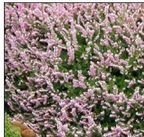
'Mediterranean Pink' winter heath

The heaths are a large group of plants, most of which are not fully hardy for landscape use, or are summer- or fall-flowering. Both alpine heath and Irish heather and their hybrid, winter heath, are hardy and among the best-known winter-flowering plants in the Pacific Northwest. In general, alpine heath and winter heath are low, spreading plants which make effective and colorful groundcovers in the winter garden. Irish heath, in contrast, has a distinctly upright habit. Among these species, there are a wide array of cultivars differing in growth habit, foliage and bloom. Flower color varies from white to pink to red.