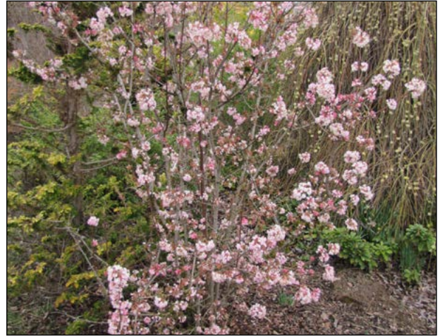
Viburnum x bodnantense ‘Dawn’