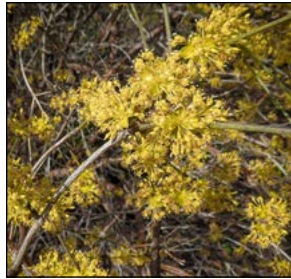
Cornelian cherry flowers

Cornelian cherry is an unusual dogwood native to southern Europe, which grows naturally as a multistemmed shrub or may be trained as a small tree. The flowers are small and yellow, lacking the large bracts that make other well-known dogwoods such popular spring-blooming trees. However, they are borne in abundance on the bare stems at the end of winter, turning the entire plant yellow in the process. The flowers are followed by edible red, or, in some cases, yellow fruit.