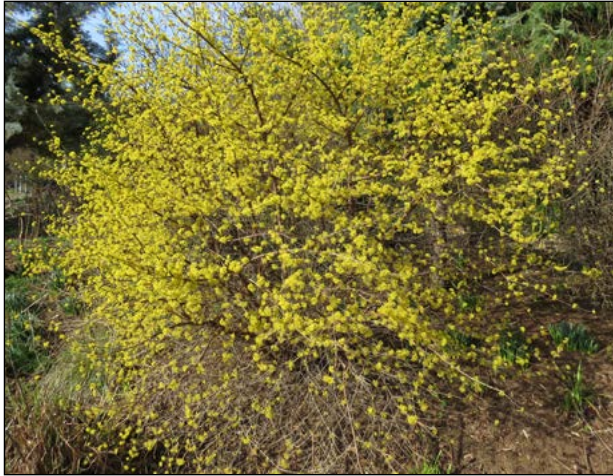
Cornelian cherry in full bloom