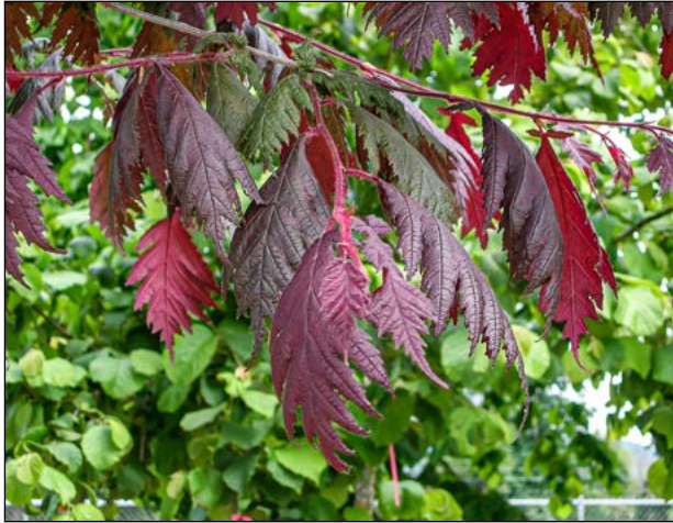
Foliage of C. avellana 'Burgundy Lace'