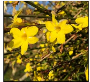
Winter jasmine blooms

Winter jasmine is an adaptable, vigorous, deciduous shrub native to northern China. It produces masses of vigorous green stems that root on contact with the soil. This enables the plant to be grown as a mounding shrub, a low hedge, a groundcover or — if some sort of support is provided — as a vine. It is often seen covering fences or trailing over walls, where the flowers are displayed to best advantage. The flower buds are waxy red and open to single, bright yellow flowers that are borne along the bare stems in January. Unlike other jasmine, the flowers are not fragrant but contrast well with the green stems.