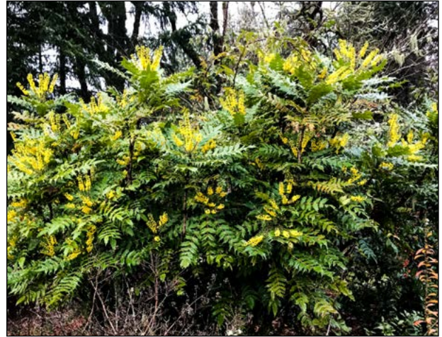
Mahonia x media 'Soft Caress'.

Cultivars: S. hookeriana var. digyna and S. hookeriana var. humilis are commonly sold forms.