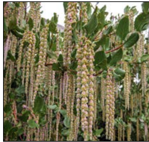
Silk tassel flowers

Silk tassel is a large, dense evergreen shrub native to the central Oregon coast southwards into California. It is dioecious, meaning there are separate male and female plants. In January, both male and female plants produce small yellow flowers in long, drooping catkins that, in male forms, may be 12 inches long. A plant in full bloom covered with catkins is a striking textural addition to the winter garden. Besides G. elliptica , G. fremontii is also native to the montane Pacific Northwest, and a smaller species, G. buxifolia , is found in southwestern Oregon. Hybrids of G. elliptica and G. fremontii go by the name of G. x issaquahensis .