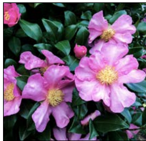
Flowers of C. sasanqua

The sasanqua camellias are a diverse group sometimes referred to as “sun” camellias because of their tolerance of full sun. The many cultivars of C. sasanqua vary in growth habit as well as flower characteristics. In general, they have dark green foliage and a habit that varies from upright and spreading. Flowers vary from single to double and from white to red. Because of variations in flower time, it is possible to have a camellia in bloom throughout the winter. The leaves of Camellia sinensis are used for tea. The species is autumn-blooming and offers single white or pink flowers.