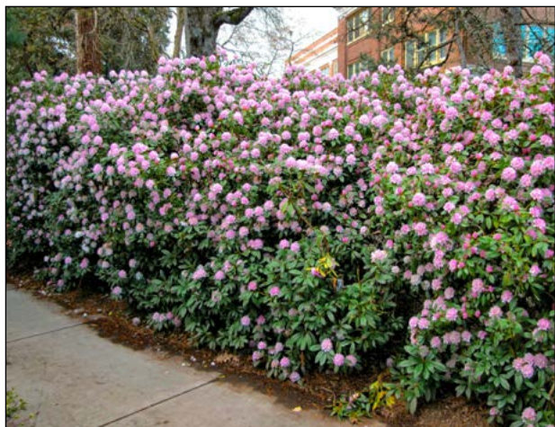
Rhododendron 'Rosa Mundi'