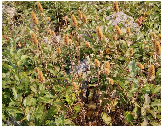
Figure 8. Dry, nettleleaf giant hyssop inflorescences on a plant growing on Black Mountain in the Caribou-Targhee National Forest.

Wildland Seed Collection. Seed can be collected by shaking or stripping it from the inflorescences or by clipping the inflorescences (Fig. 9) (Plummer et al. 1968). If using historical herbaria records to find collection sites, note that one study found nettleleaf giant hyssop populations shifted up in elevation over time (Zorio et al. 2016). This study is summarized in the Distribution section.