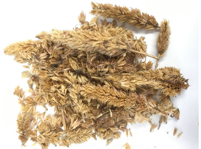
Figure 10. Seeds, bracts, and other plant material that will need to be separated in the cleaning process from a harvest of nettleleaf giant hyssop seed heads.

Post-collection management. Seed should be moved to a controlled short-term storage environment as soon as possible and until that time should be kept in a dry, shaded place. Short-term storage should be a dry, cool place inaccessible to rodents or other seed predators. If insects are suspected in any collection, seed should be frozen for 48 hours or treated with an appropriate insecticide. The more plant material in the collection, the more ventilation and drying a seed lot may need (Gold n.d.; Hay and Probert 2011).