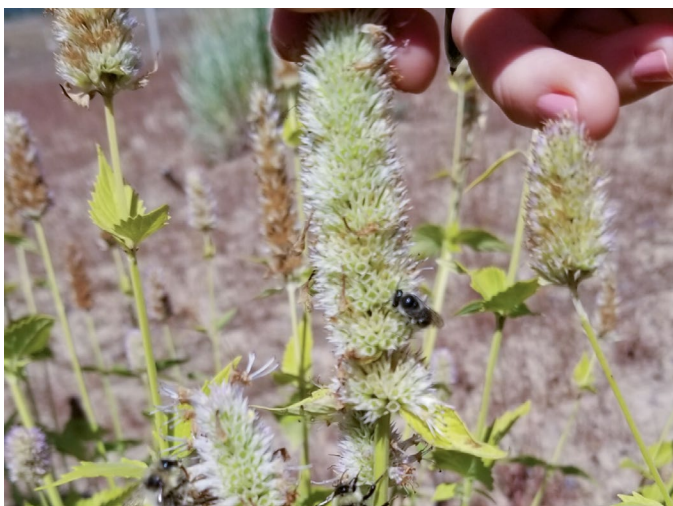
Figure 13. Nettleleaf giant hyssop being visited by several pollinators at Bloomington Lake on the Caribou-Targhee National Forest.

It has been seeded for restoration in mountain rangelands in Utah. Based on studies of restoration on big game range in Utah, Plummer et al. (1968) rated nettleleaf giant hyssop good for: handling, ease of planting, compatibility with other plants, seed production, herbage yield, grazing tolerance, resistance to disease and insects, and early spring and summer palatability. The species was rated fair for: germination, growth rate, final establishment, persistence, natural spread, soil stability, and ease of transplanting. They rated initial establishment and range of adaptation as poor (Plummer et al. 1968).