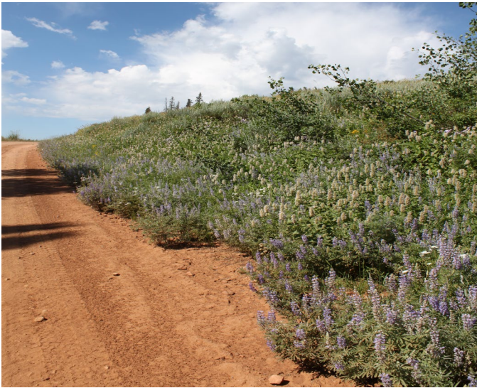
Figure 1. Nettleleaf giant hyssop growing in a roadside shrubland in Utah.

Shrub dominance varies in mountain brush or thickets where nettleleaf giant hyssop is common. In eastern Whitman County, Washington, and Latah County, Idaho, nettleleaf giant hyssop was characteristic of black hawthorn/common snowberry ( Crataegus douglasii / Symphoricarpos albus ) thickets 0.6 to 1 foot (0.2-0.3 m) tall on northern aspects (30-50% slope) at 2,500 to 2,600 feet (760-800 m) (McMinn 1952). It also occurred in common snowberry thickets growing within Idaho fescue meadows in the Columbia Basin Province (Franklin and Dyrness 1973). In the Lake Tahoe Region of Nevada and California, nettleleaf giant hyssop occurred in Geyer willow ( Salix geyeriana ) hedges that lined wet meadows along the Truckee River (Smiley 1915). In Utah's Wasatch Mountains nettleleaf giant hyssop occurred in the canopy openings of tall bigtooth maple ( Acer grandidentatum ) shrublands on north and east slopes with highly fertile loam soils (Allman 1953). It was also abundant in the mountain snowberry ( Symphoricarpos oreophilus )/forb community in the subalpine zone of the Wasatch Plateau. This tall shrubland occurred on south slopes exposed to extreme drying by full sun and southwest winds and had just 48% vegetation cover. Cover of rock was 16%, bare ground was 11%, and nettleleaf gaint hyssop cover ranged from 10 to 25% (Ellison 1954).