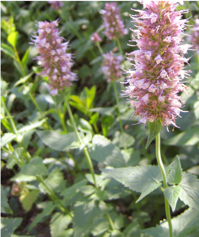
Figure 6. Close-up of nettleleaf giant hyssop inflorescence.

Nettleleaf giant hyssop seed production was low for plants grown in an outdoor experimental garden at Waterloo University, Ontario, Canada. Plants were grown from seed collected in Klamath Falls, Oregon. When inflorescences were bagged and protected from pollinators, no seed was produced. Seed was produced, but production was low, when inflorescences were open-pollinated. Just 22 viable seeds were produced from 100 fruiting flowers. Meiosis and pollen formation were normal and all pollen was good, causing researchers to wonder if low seed production was due to a lack of suitable pollinators for the timing of flowering of the non-local seed source in the common garden (Gill 1979).