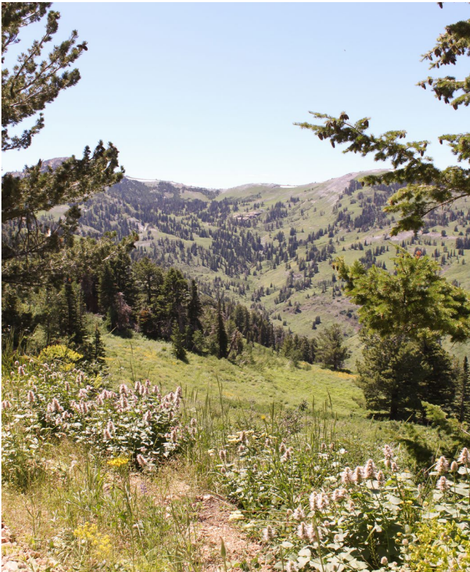
Figure 3. Nettleleaf giant hyssop growing in a subalpine meadow in Utah.

var. shastensis ) forests. These meadows were similar to the mesic tall forb community described for the Wasatch Mountains of Utah (Franklin and Dyrness 1973), where nettleleaf giant hyssop also occurs (Ostler and Harper 1978). In central Idaho, nettleleaf giant hyssop was a widespread species in several early seral, Douglas-fir forest types, many of which included an abundance of ponderosa pine (Steele and Geier-Hayes 1995). In Utah, nettleleaf giant hyssop occurred on high plateaus in Engelmann spruce ( Picea engelmannii )-subalpine forests with low annual temperatures, high winds, and short growing seasons (Dixon 1935).