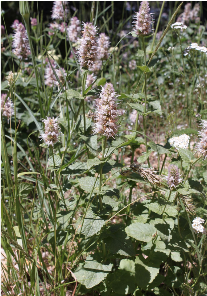
Figure 4. Nettleleaf giant hyssop plant in flower.

crushed give off a strong minty/anise smell. Plant pubescence can vary. In California, plants growing in the Coast Ranges were more pubescent than those in the Sierra Nevadas (Munz and Keck 1973). Stems are simple or branched near the top (USDA FS 1937).