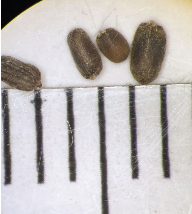
Figure 11. Individual nettleleaf giant hyssop seeds (1.5-2 mm long). Millimeter is the unit of measure pictured.

Manufacturing, Slagelse, Denmark). The brush machine was fitted with a #14 mantel with pins and run at medium speed; 2) seeds were then air-screened using an office Clipper with 1/16 round top screen, 30 x 30-wire bottom screen, medium speed, and medium air. This cleaning process yielded seed that was 98% pure and 91% viable (tetrazolium [TZ] determined) (Barner 2009).