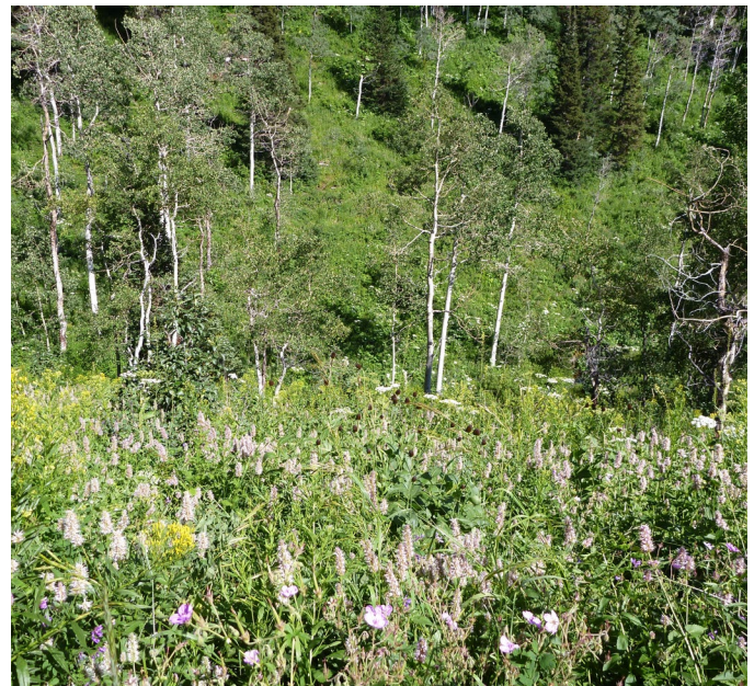
Figure 2. Large stand of nettleleaf giant hyssop growing in a quaking aspen woodland opening in Utah.

stands occurred in the Park: stands with open canopies growing on xeric hillsides and densely shaded stands on flatter terrain. Nettleleaf giant hyssop only occurred in the open hillside stands (Reed 1952). In quaking aspen woodlands near Salt Lake City, Utah, that were ungrazed for 50 years, nettleleaf giant hyssop was a dominant understory forb (Bartos and Mueggler 1982). In the Mink Creek area near Pocatello, Idaho, nettleleaf giant hyssop was common in the Rocky Mountain juniper/mountain big sagebrush-mountain snowberry/basin wildrye ( Leymus cinereus ) vegetation type. These woodlands were considered mid-seral and occurred on mixed carbonate substrates with less than 25% average tree cover (Rust 1999).