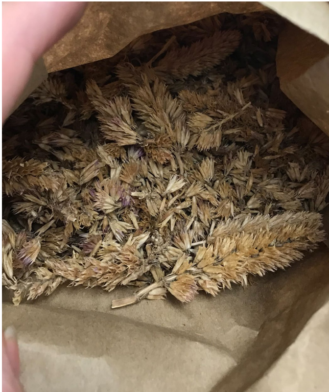
Figure 9. Harvested nettleleaf giant hyssop seed heads.

Collection methods. Wildland seed can be collected by hand-stripping the seed from the seed heads, or shaking or beating the seed heads into a container (Fig. 10) (Plummer et al. 1968; Skinner 2005; Riley and Fisher 2018).