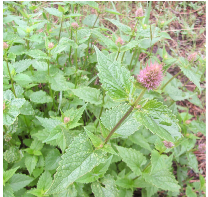
Figure 5. Nettleleaf giant hyssop leaves are arranged opposite along the square stem.

Leaves are opposite, petiolate, and 0.4 to 2 inches [1-5 cm] long. Leaves are triangular to egg-shaped, coarsely and irregularly serrate along the edges, and have heart-shaped bases (Fig. 5) (Munz and Keck 1973; Cronquist et al. 1984; Hitchcock and Cronquist 2018). Larger leaves are 1.6 to 4 inches (4-10 cm) long and 0.8 to 3.2 inches (2-8 cm) wide (Hitchcock and Cronquist 2018). Leaves are green on both surfaces, although undersides can be slightly paler than the upper, and they are often purplish near the base (USDA FS 1937; Tilley and Pickett 2019).