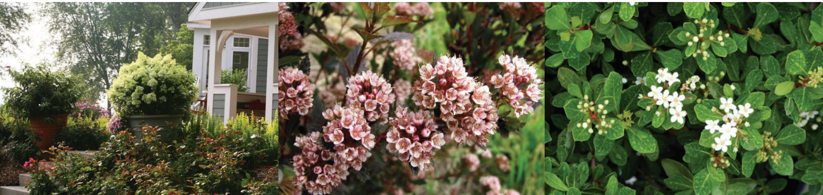
From left to right: Hydrangea paniculata Bobo®, Physocarpus opulifolius Little Devil™, and Viburnum obovatum 'Mrs. Schiller's Delight'.