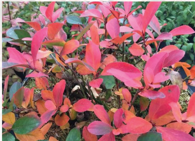
Aronia melanocarpa Low Scape® Mound

From the National Arboretum's plant breeding program, 'Nikko Blush' was selected as a pink flowering dwarf that is relatively fast growing to a height of 3'. Flowers appear