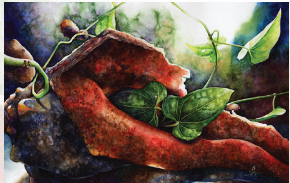
Painting by Sidra Kaluszka