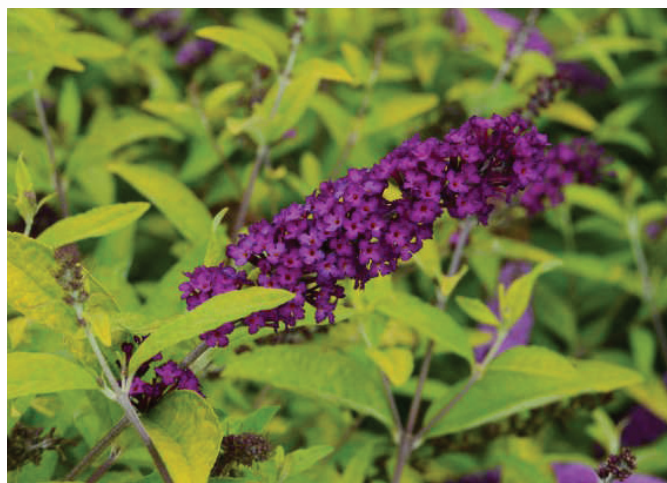
Buddleia Humdinger ™ 'Little Nuggett' PPAF