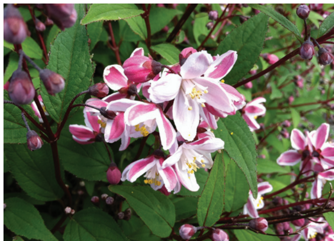
Deutzia x rosea 'Nikko Blush'