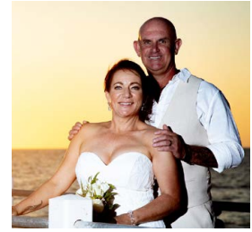
Cansdale – Fairnie

May (current staff) and Lachlan (CC2010) on 14 January 2023.