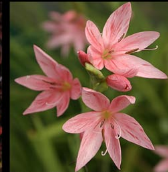
Schizostylis coccinea 'Pink Marge'