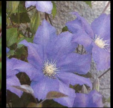
Clematis 'H. F. Young'