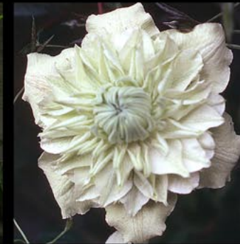
Clematis florida var. flore-pleno