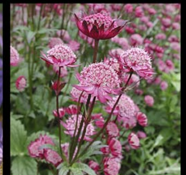
Astrantia 'Hadspen Blood'