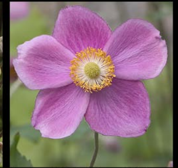
Anemone hybrida 'Rosenschale'