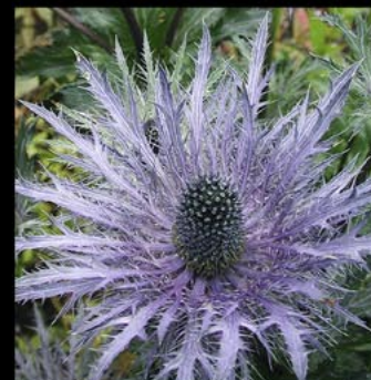
Eryngium alpinum 'Slieve Donard'