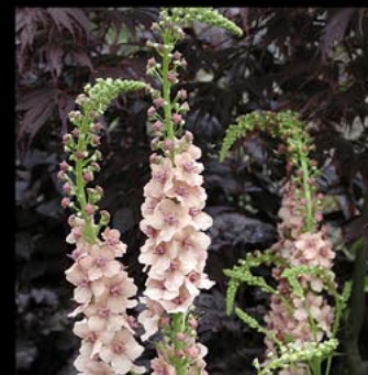
Verbascum 'Ellenbank Jewel'