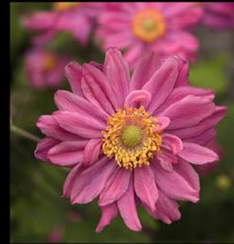
Anemone hybrida 'Pamina'