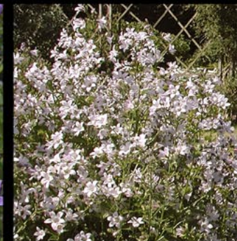
Campanula lactiflora 'Loddon Anna'