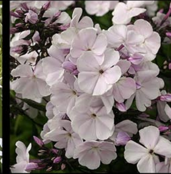
Phlox p. 'Monica Lynden-Bell'