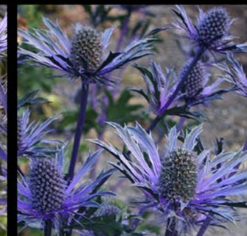
Eryngium x zabelii 'Violetta'