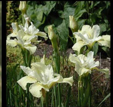
Iris sibirica 'Butter & Sugar'