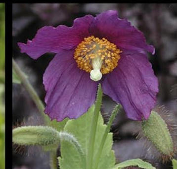
Meconopsis b. 'Hensol Violet'