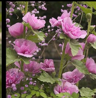
Alcea x Althaea 'Parkrondell'