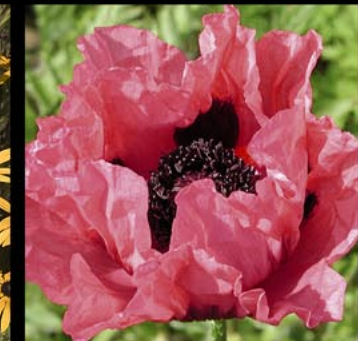
Papaver orientale 'Sultana'