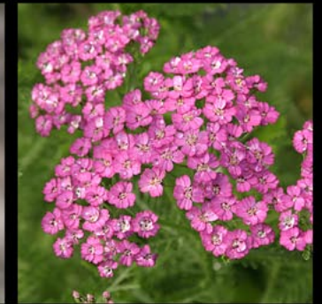
Achillea 'Pretty Belinda'