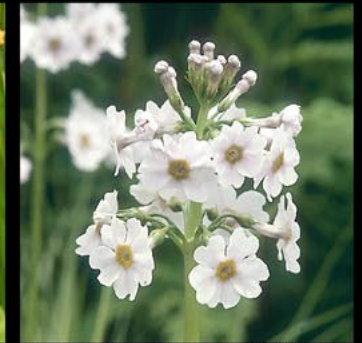
Primula japonica 'Postford White'