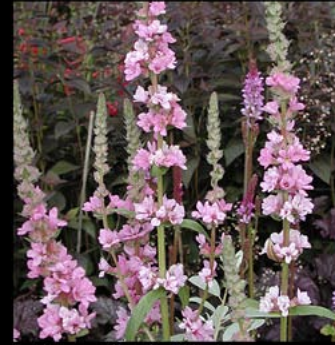
Lythrum salicaria 'Blush'