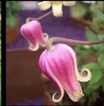
Clematis 'Buckland Beauty'