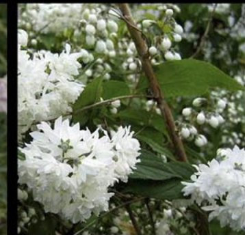
Deutzia scabra 'Candidissima'