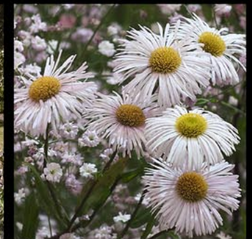
Erigeron 'Snow White'