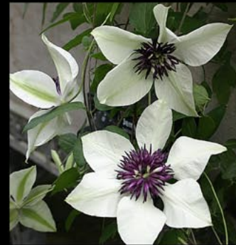
Clematis florida var. sieboldiana