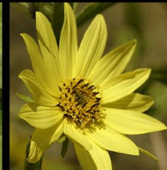
Helianthus 'Lemon Queen'