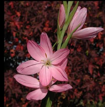
Schizostylis coccinea 'Big Moma'