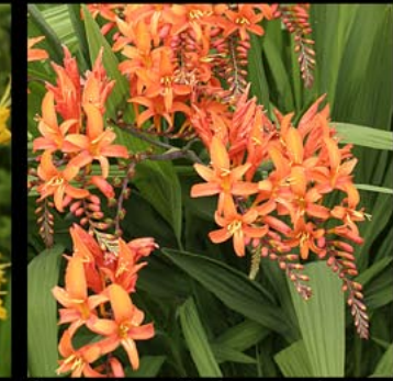
Crocosmia x c. Zeal -unnamed