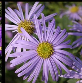
Aster x frikartii 'Mönch'