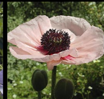
Papaver orientale 'Karine'