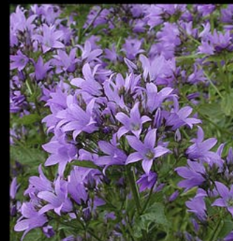
Campanula l. 'Prichard's Variety'