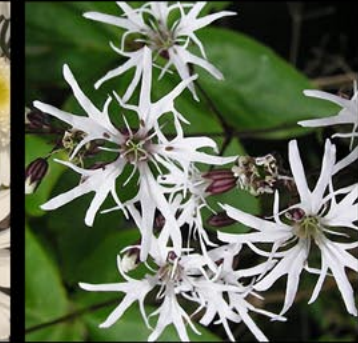
Lychnis flos-cuculi 'White Robin'