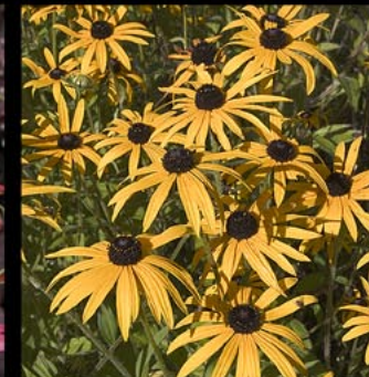
Rudbeckia fulgida var. deamii