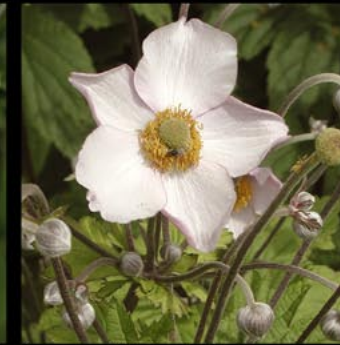
Anemone t. 'Robustissima'