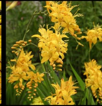
Crocosmia m. 'Rowallane'