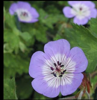
Geranium w. 'Buxton's Variety'