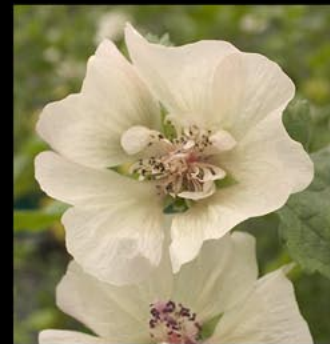
Alcea x Althaea 'Parkallee'