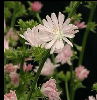
Cichorium intybus 'Roseum'