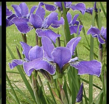
Iris sibirica 'Silver Edge'