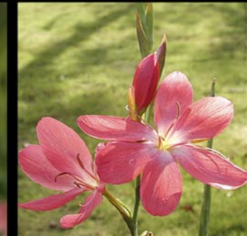
Schizostylis coccinea 'Zeal Salmon'