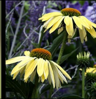
Echinacea purpurea 'Sunrise'