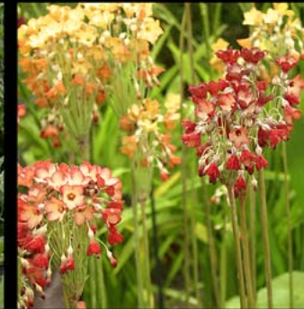
Primula f. 'Orange & Red Forms'