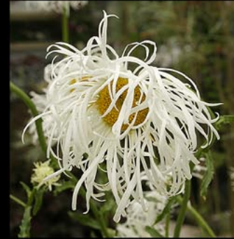
Leucanthemum x s. 'Old Court'