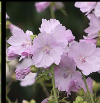
Malva moschata 'Apple Blossom'