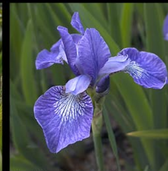
Iris sibirica 'Baby Sister'