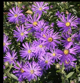
Aster amellus 'Violet Queen'