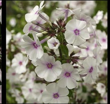
Phlox maculata 'Reine du Jour'