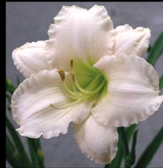
Hemerocallis 'Lullaby Baby'