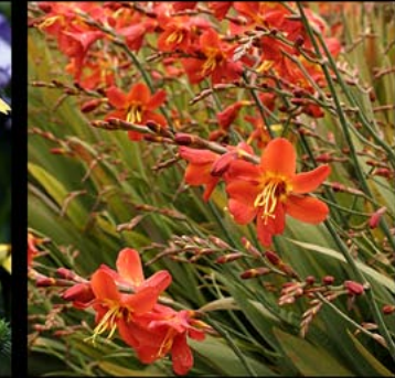
Crocosmia x c. 'Saracen'