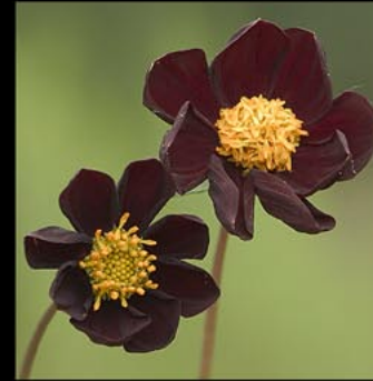
Dahlia x cosmos 'Mexican Black'