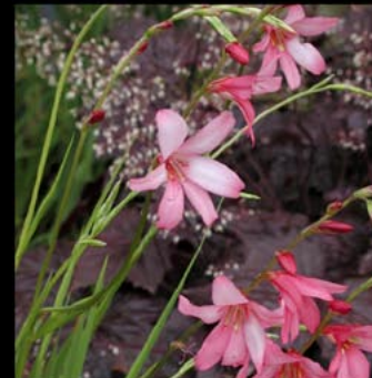
Tritonia disticha subs. rubrolucens