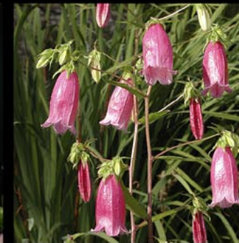
Campanula punctata 'Cherry Bells'