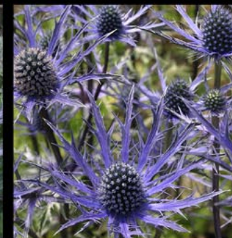
Eryngium x 'Cobalt Star'