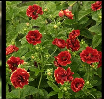
Potentilla 'Arc en Ciel'