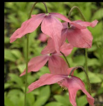
Meconopsis x cookei