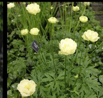
Trollius x cultorum 'Cheddar'