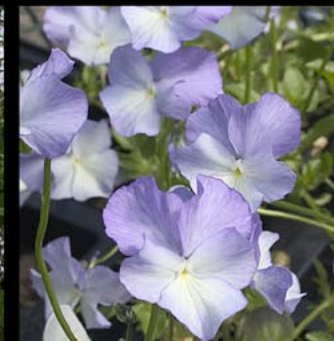
Viola 'Kitty White'