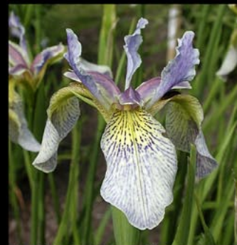
Iris 'Ellenbank Damsel'fly'