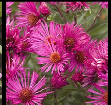
Aster novae-angliae 'Septemberrubin'