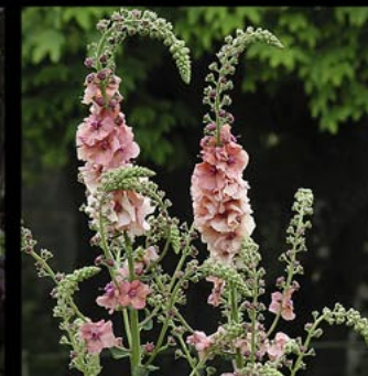
Verbascum 'Coitswold Beauty'