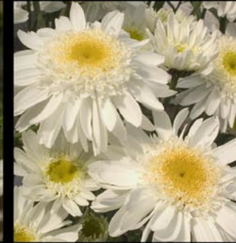
Leucanthemum x s. 'Sunny Side Up'