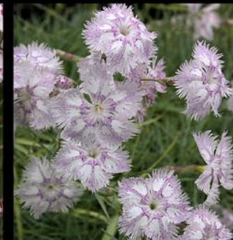
Dianthus 'Tatra Ghost'