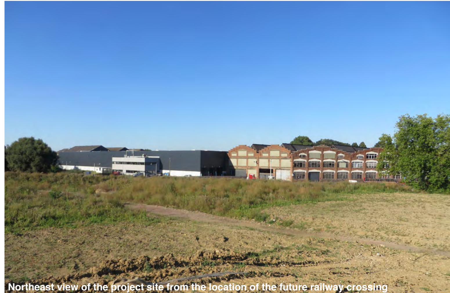
Northeast view of the project site from the location of the future railway crossing