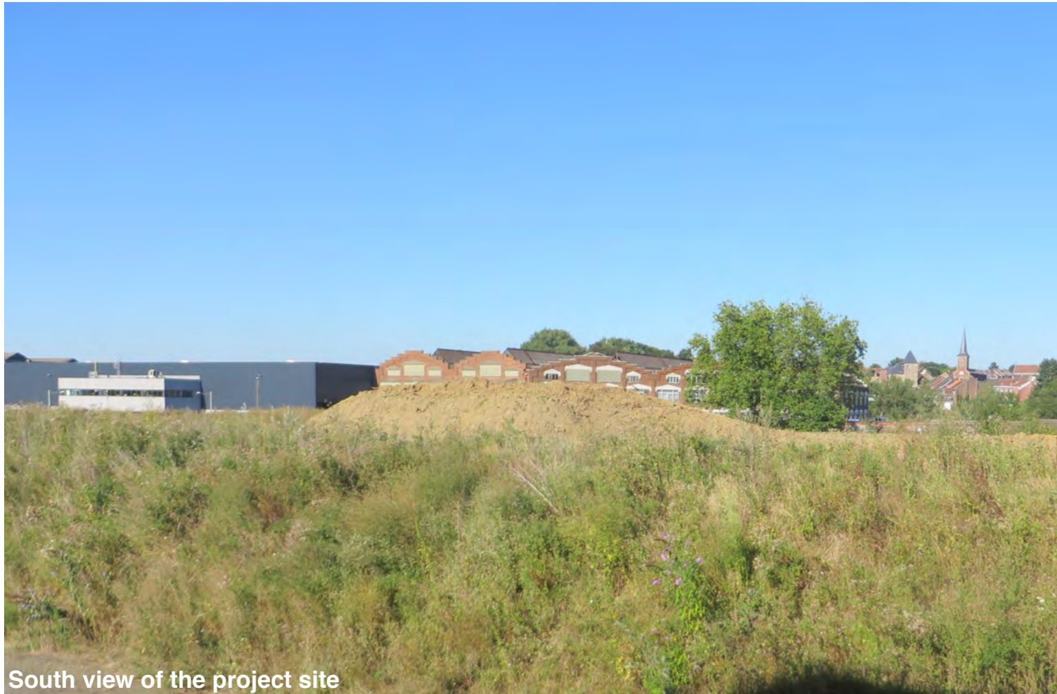
South view of the project site