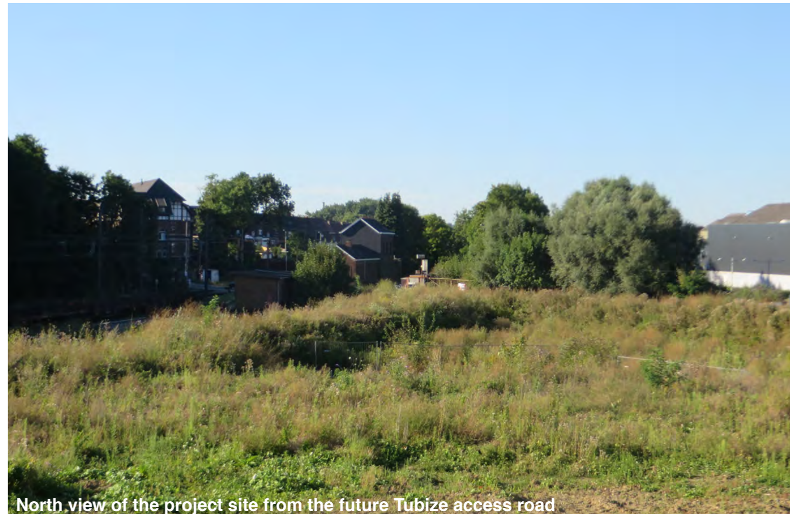
North view of the project site from the future Tubize access road