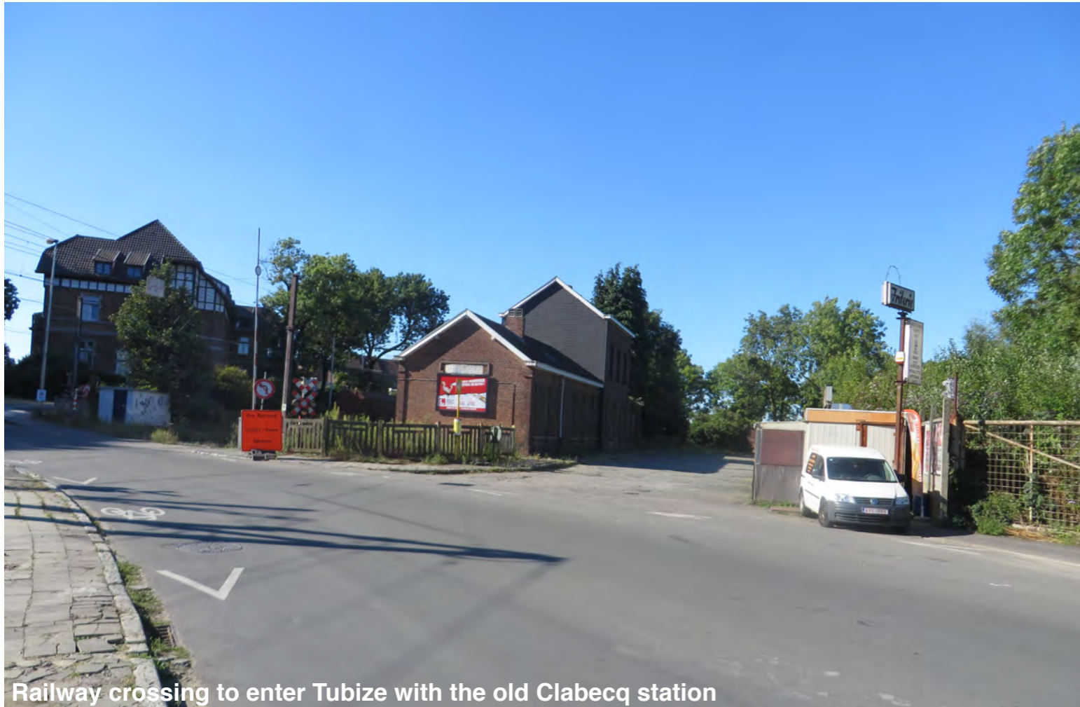
Railway crossing to enter Tubize with the old Clabecq station