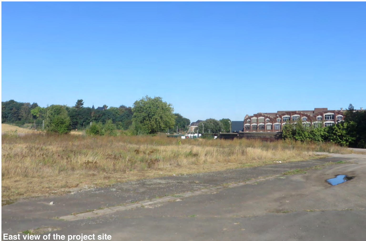
East view of the project site