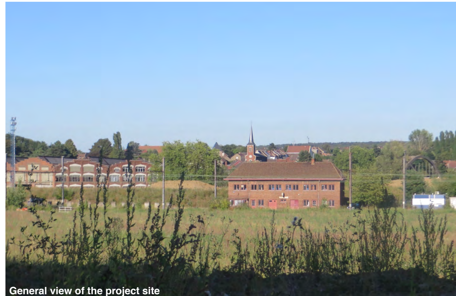
General view of the project site