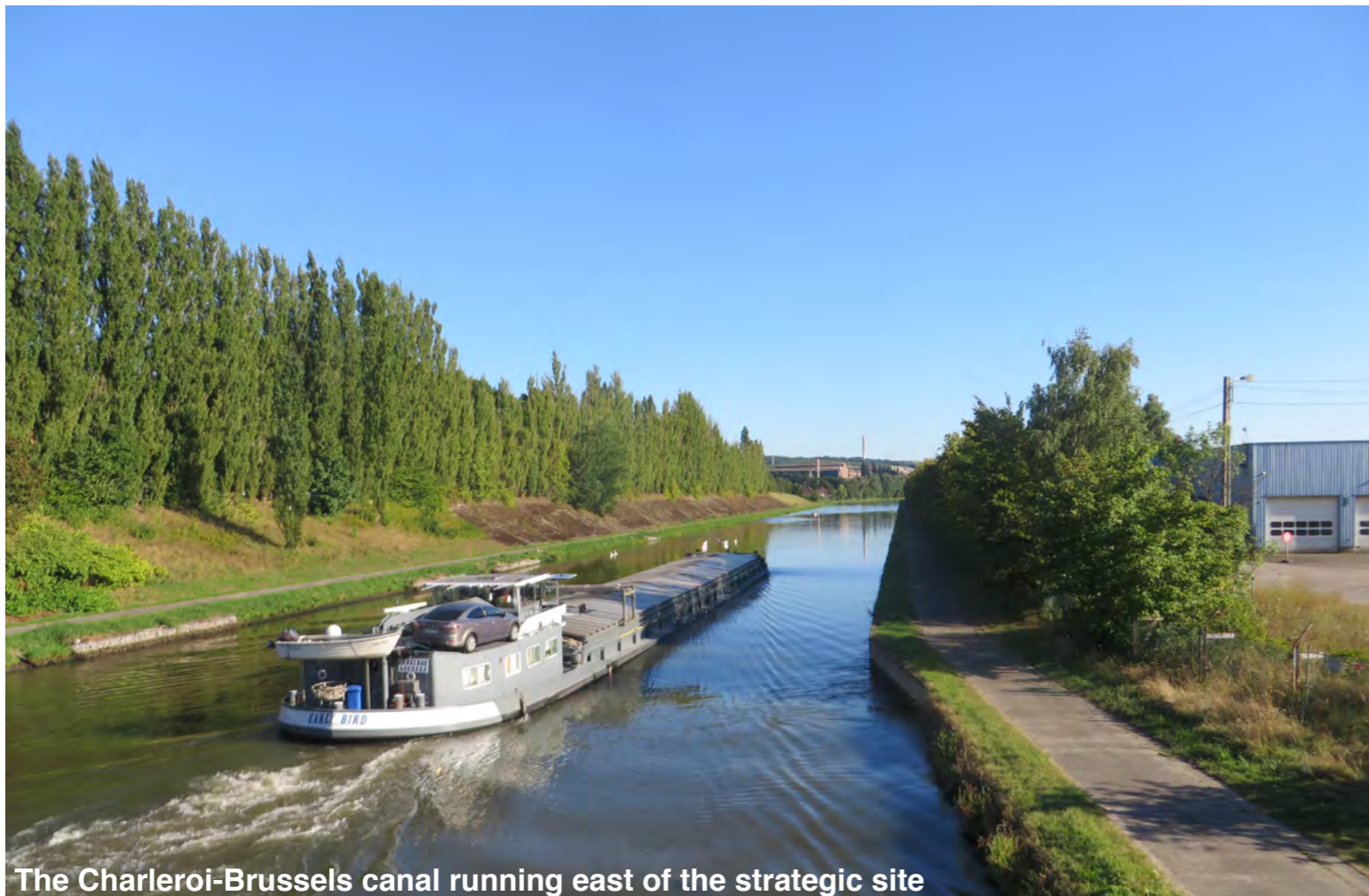
The Charleroi-Brussels canal running east of the strategic site