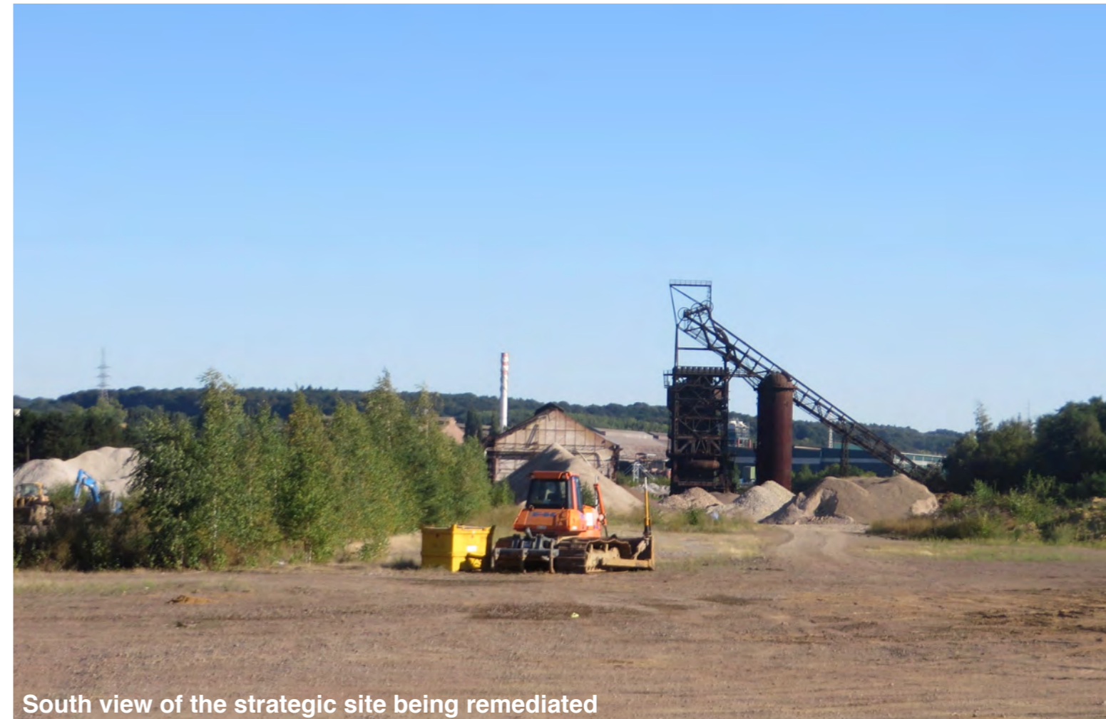
South view of the strategic site being remediated