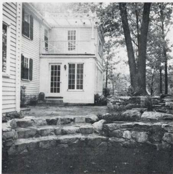
View of west side of garden

The planting on the west side consists of galax, leucothoe, pyrola, trailing arbutus, dwarf Alberta spruce, dwarf Hinoki cypress, daphne, azaleas,