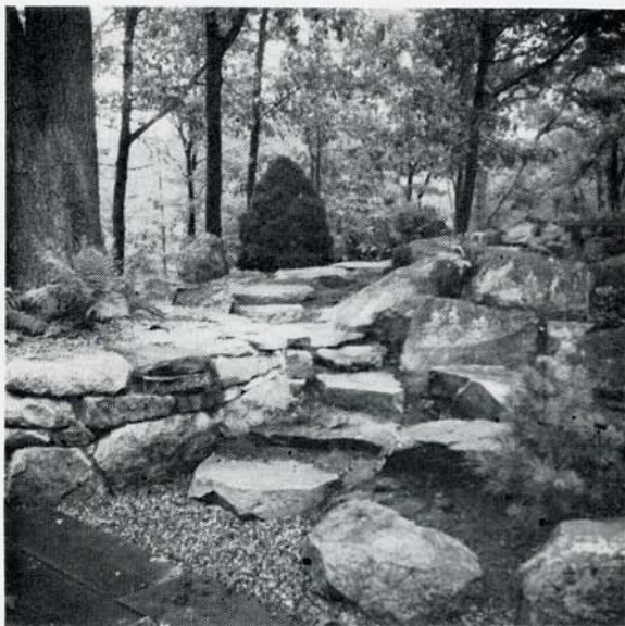
Path leading from flagstone terrace