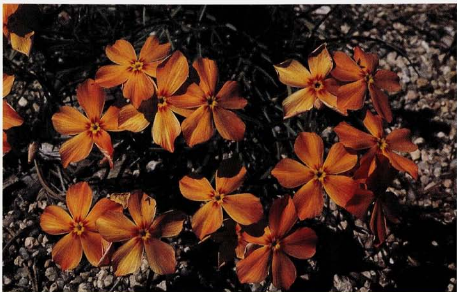
Phlox mesoleuca 'Tangelo'