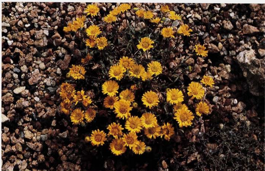
Erigeron chrysopsidus v. brevifolius 'Grand Ridge'