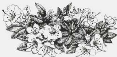
Rhododendron keiskei 'Yaku Fairy'