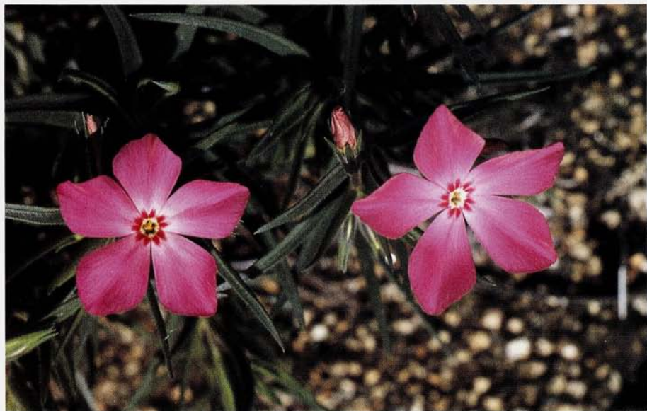
Phlox mesoleuca 'Arroyo'