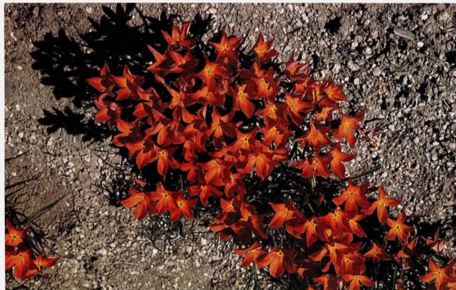
Phlox mesoleuca 'Manzana'