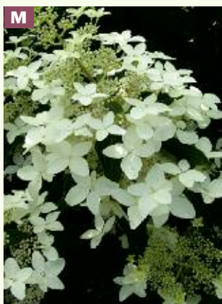
STARLIGHT FANTASY 'Degustar' ★★

* Recommended to be rescinded at the AGM Review in 2012