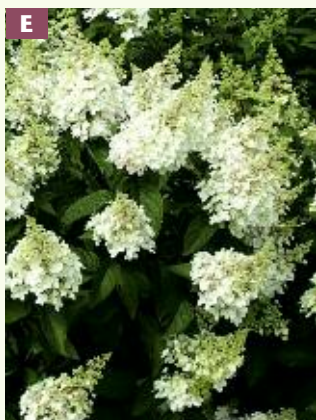
Hydrangea paniculata 'Pinky-Winky' 'Dvppinky' PBR AGM(H4)2008

Habit: Nicely upright to lightly spreading, compact, 140 × 160cm. Foliage: Yellow green, greener than 146A, petioles flushed dark red. Stem: Strongly flushed deep purplish red 187C/D, maturing to brown 175A/B. Panicle: Dense, conical and tapered. Fertile floret: Buds tipped pink, petals white. Sterile floret: Lime green 150C, maturing through greyed yellow 160D to white with pink bosses, very deep pink at the end of the season. Scent: Spicy. Flowering: From early August to the first week of October.