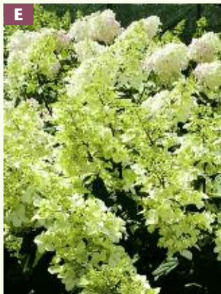
Hydrangea paniculata 'Pink Lady' AGM subject to availability

Habit: Upright to arching, 170 × 210cm. Foliage: Green 147A. Stem: Green in inflorescence, brown 177C elsewhere in later season. Panicle: Half open to dense, long with a rounded top. Fertile floret: Cream bud with pink tip. Sterile floret: Cream maturing to white, becoming flushed with pink 57D at the end of the season. Flowering: From early July to early October 2008.