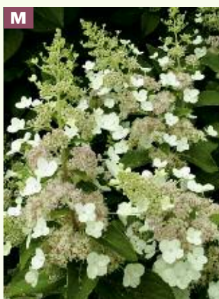
'Tender Rose' ★

A half open panicle, initially displaying a nice contrast between pink fertile buds and white sterile florets which mature to an unremarkable pale pink. Pruning has no marked effect. Flowering from mid July to late September. 115 × 120cm.