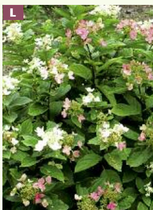
DART'S LITTLE DOT 'Darlido' PBR