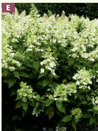
Hydrangea paniculata 'Big Ben' AGM(H4)2008

Habit: Upright and slightly spreading, 170 × 180cm.