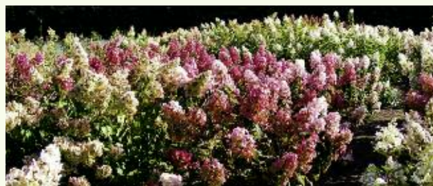
Hydrangea paniculata Trial September 2007