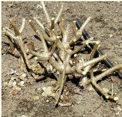
1 Hard pruning (to two buds)