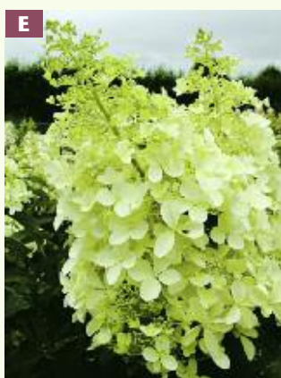
Hydrangea paniculata 'Dolly' AGM subject to availability

Habit: Upright and spreading, 165 × 160 cm.