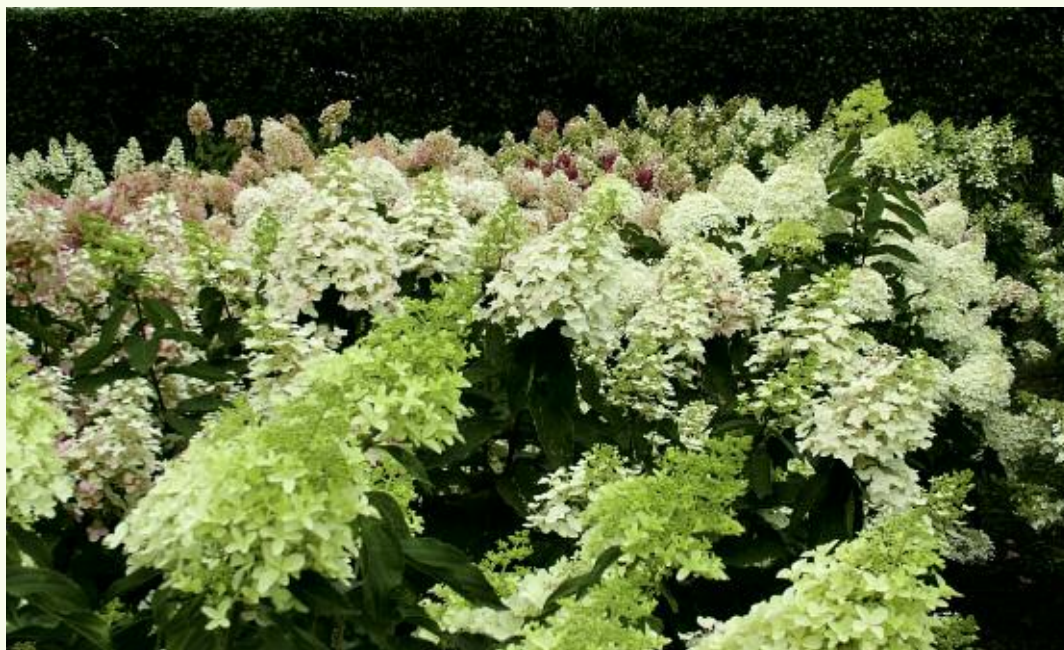
Front cover: Hydrangea paniculata 'Limelight'

In the 1950s, at the embryonic Kalmthout Arboretum and later at Hemelrijk, Robert and Jelena de Belder began to experiment with raising and selecting seedlings of H. paniculata , derived initially from an old plant in their garden of 'Floribunda'. The first and most famous of these,