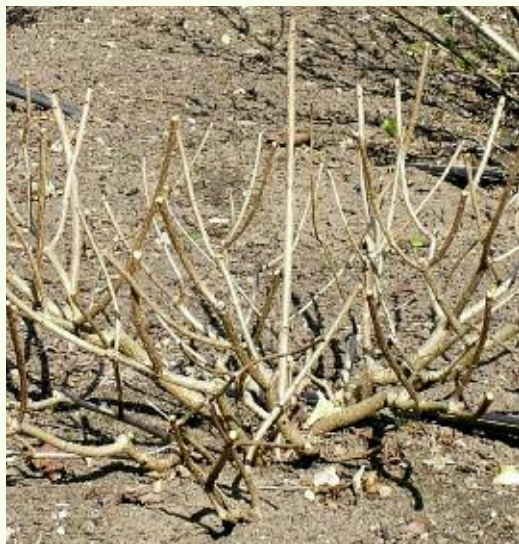
2 Moderate pruning (to four buds)

Where there was a response to pruning, the lightly pruned plants were the first to flower and carried more, smaller flowers than the hard-pruned plants, which flowered later, and bore larger, fewer panicles. Those plants subjected to moderate pruning were intermediate in panicle size and time of flowering. Although the hard-pruned plants tended to grow with added vigour, their larger flowerheads were not always advantageous, sometimes producing panicles that could not be supported and flopped.