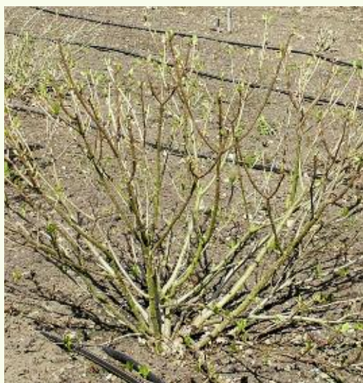
3 Light pruning (removal of previous year's flowerheads only)

Where there was a response to pruning, the lightly pruned plants were the first to flower and carried more, smaller flowers than the hard-pruned plants, which flowered later, and bore larger, fewer panicles. Those plants subjected to moderate pruning were intermediate in panicle size and time of flowering. Although the hard-pruned plants tended to grow with added vigour, their larger flowerheads were not always advantageous, sometimes producing panicles that could not be supported and flopped.