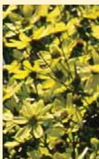
Coreopsis verticillata 'Moonbeam' AGM (H4) 2001