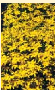
Coreopsis verticillata 'Grandiflora' AGM (H4) 1993 Reconfirmed 2001

Flowers early July to late September. Plant 60cm high, 70cm wide; tall erect habit with many stiff, well-branched flowering stems. Leaves opposite, sessile, palmately divided into filiform segments, 5.5cm long and 8cm wide. Flower heads 3.5-4cm diameter, single; disc 1cm diameter, 0.5cm high, green-gold to maroon brown on ageing; ligules 8, 1.8 × 0.9cm, slightly overlapping at base, golden yellow (12A/14A), tips blunt, 3-toothed.