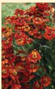
Helenium 'Baudirektor Linne' AGM (H4) 2001

Flowers early July to late September. Plant 90cm high, 80cm wide; tall, erect habit with stiff, airy, branched flowering stems. Leaves sessile, palmately divided into filiform segments, 6.5cm long and 10cm wide. Flower heads 6cm diameter, single; disc 0.8cm diameter, 0.4cm high, lemon yellow to dark brown on ageing; ligules 8, 3 × 1.4cm, overlapping at base, deep golden yellow (17B), tips pointed.