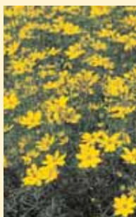
Coreopsis verticillata 'Old Timer' AGM (H4) 2001

Flowers early July to late September. Plant 50cm high, 90cm wide; erect habit with stiff, airy, well branched flowering stems. Leaves opposite, sessile, palmately divided into filiform segments, 5cm long and 6cm wide. Flower heads 4cm diameter, single, held in loose inflorescence; disc 0.8cm diameter, 0.3cm high, golden; ligules 8, 1.8-2 × 0.8cm, separate, very pale yellow (4B), tips rounded.