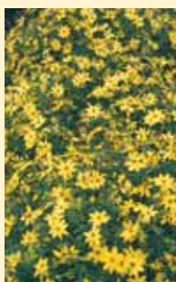
Coreopsis verticillata 'Zagreb' AGM (H4) 2001

Flowers early July to mid September. Plant 80cm high, 80cm wide; tall, erect habit with stiff, airy, branched flowering stems. Leaves opposite sessile, palmately divided into filiform segments, 4cm long and 7cm wide. Flower heads 4.5cm diameter, single; disc 0.8cm diameter, 0.3-0.4cm high, yellow; ligules 8, 2 × 1cm, separate, golden yellow (14B), tips blunt, 3-toothed.