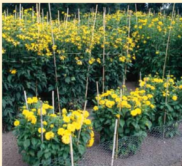
Above: Rudbeckia Trial