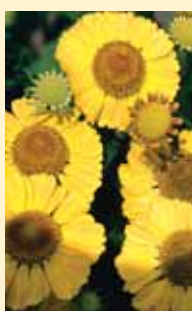
Helenium 'Blütentisch' AGM (H4) 2001

Flowers mid August to early September. Plant 1.7m high; tall, upright, vigorous clumps. Leaves to 18cm long and 4cm wide. Flower heads 6cm diameter, single, ± horizontal; disc 2cm diameter, 1.5cm high, gold-red outer circle and brown-red centre (166A/187A) covered in rich gold anthers (17A); ligules 12-14, 3 × 1.6cm, gaps between near disc, red (45A/42A/34A) flecked with vivid gold (14A) fading to reddish orange brown (171A/B/179A), underside (180A/179A/171A/B), tip reflexed, three lobed.