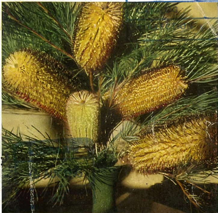
A SPECIMEN OF THE BANKSIA FAMILY. See page 13.