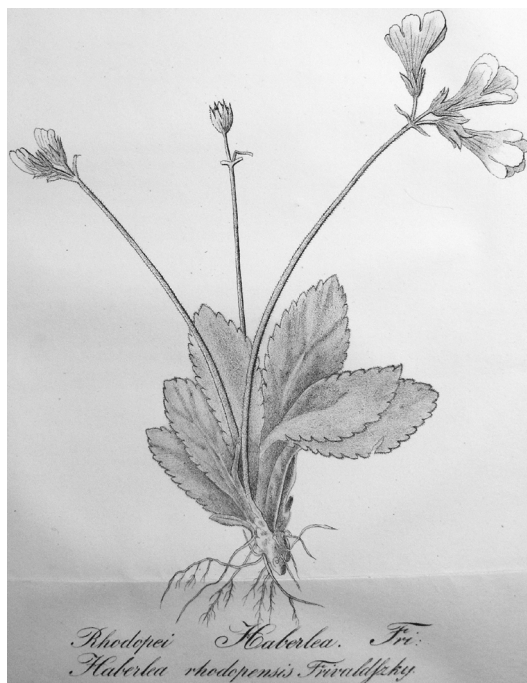
Fig. 1. Reproduction of original illustration of Haberlea rhodopensis from Frivaldszky (1835a: table 1).

quently in many places on shaded calcareous rocks.