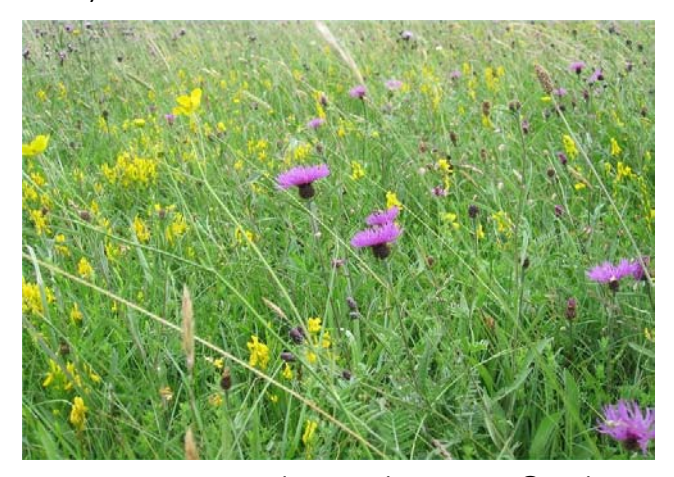
Genista tinctoria and Serratula tinctoria

and the occasional plant of Pepper-saxifrage ( Silaum silaus ).