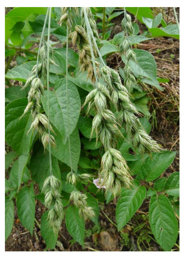
Bromus interruptus

The earliest known specimen of Interrupted Brome was collected in 1849 at Odsey in Herts, but it was not formally described (as a variety of B. mollis L. = B. hordeaceus L.) until 1889 (Druce, 1889). He subsequently raised it to full species level (Druce, 1895).