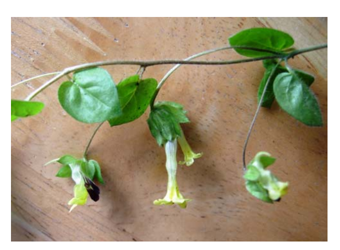
Fluellin ( Kickxia spuria ) with normal and actinomorphic flowers