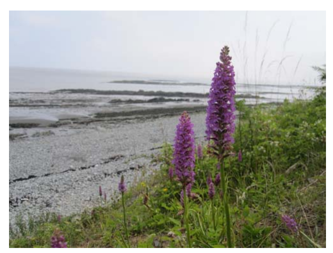
Gymnadenia densiflora

June got under way with a trip to Exmoor to check up on the only Somerset site for Small Adder'stongue ( Ophioglossum azoricum ) which was a success, though the adjacent site for Moonwort ( Botrychium lunaria ) did not produce a result. We fared no better at an old site for Lesser Twayblade ( Neottia cordata ). Searching for old records can be hard going and discouraging at times — but SO well worth it when successful!