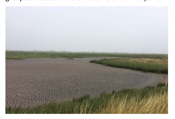
Steart Mud

Saturday was planned to have a thorough look at the Wildlife and Wetlands Trust reserve at Steart, by the River Parrett. The reserve is primarily for birds, and to create habitat for wildfowl and waders a breach has been created in the tidal river bank, forming a series of lagoons and intertidal fields which are periodically inundated. There are public paths and hides, but WWT are very friendly to botanists, and organise surveys of the general biodiversity interest of their holdings. We therefore had access to areas not open to the public, and were to make some of the first botanical recordings of the newly created habitats. Kitted up with yellow hi-viz tabards (WWT policy for off-road work), we divided into three groups and set off into three different 1km squares.