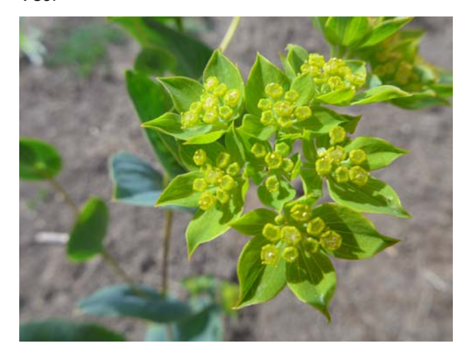
Bupleurum rotundifolium

this hybrid in VC5 and an unusual inland record in VC6.