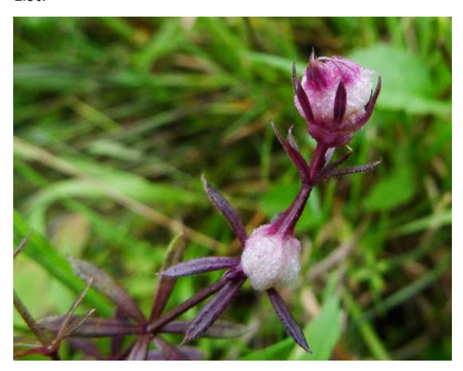
Galium uliginosum infected with gall wasp Dasineura hygrophila

We then split into two recording groups to range over a wider area of this botanically interesting site, one group going down slope towards the damp valley mires and scrubby edge of the river and the other group staying higher up amongst the gorse scrub and rough grassland. The Purple Moor-grass (Molinia caerulea) was well grazed and we jumped from tussock to tussock and negotiated the sinking peaty mud to find the tiny pale pink flowers of Pale Butterwort (Pinguicula lusitanica), a carnivorous plant that traps small insects on the sticky glands of its in-rolled leaves. This species has a highly restricted western distribution in Britain & Ireland. We found many other mire species in the wet peat of the runnels that run down the slope including Marsh Lousewort (Pedicularis palustris), Bogbean (Menyanthes trifoliata), Marsh St John's-wort (Hypericum elodes), Bog Pimpernel (Anagallis tenella), Star Sedge (Carex echinata), Bog Asphodel (Narthecium ossifragum), Lesser Skullcap (Scutellaria minor) and Marsh Arrowgrass (Triglochin palustris). We found an extraordinary number of 'target' species for the Somerset Rare Plant Register, including at least a dozen declining widespread species listed as Near Threatened in the England Red List.