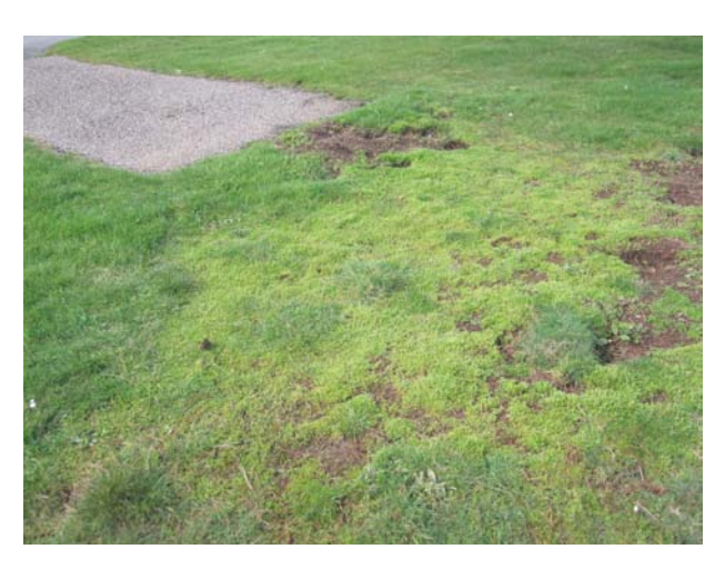
Poa infirma at Hoburne caravan park