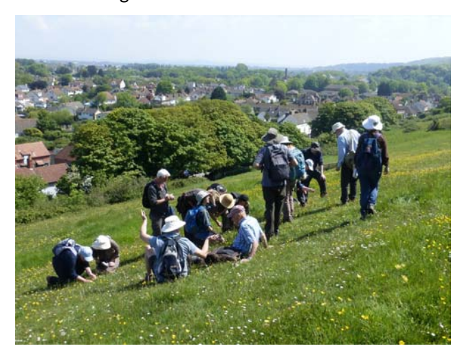
SRPG at Uphill

vulgaris), Crested Hair-grass (Koeleria macrantha), Quaking-grass (Briza media) and Spring Sedge (Carex caryophyllea). Several botanists spent ages sitting on the path, finding Little Mouse-ear (Cerastium semidecandrum) which has bracts with broad scarious margins.