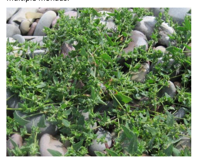
Atriplex x gustafssoniana

The last outing of the month was to Triscombe Quarry - the monad had some previous records but no one had ventured into the quarry itself. In the event we were disappointed to find no aquatic plants in the deep water pools, but we still found 8 front-of-cards including abundant Euphrasia anglica and Plantago major subsp intermedia. Later in the month SRPG held one of its most successful and best attended SRPG workshops so far, for Atriplex and salt-marsh species, at Wall Common. Having collected reference samples of Atriplex glabriuscula and A. x gustafssoniana at the meeting and had them confirmed by Dr John Akeroyd it seemed logical to continue to use that knowledge and a walk from Lilstock to Hinkley Point found both targets in multiple monads.