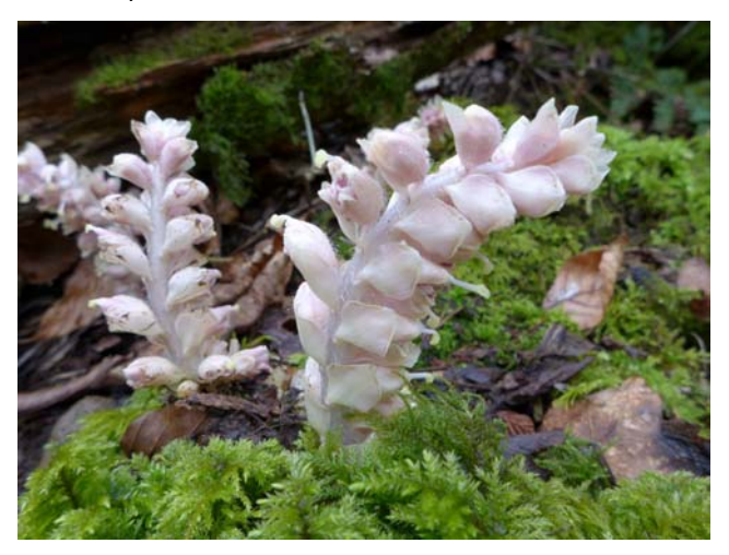
Lathraea squamaria

taken near the camp before finding the path down to the River Avon through Nightingale Valley. The woodland here is semi-natural, broadleaved and ancient, and species recorded here included Narrow-leaved Bitter-cress (Cardamine impatiens) Hard Shield-fern (Polystichum aculeatum), Wood Melick (Melica uniflora) and numerous spikes of Toothwort (Lathraea squamaria) under Hazel (Corylus avellana).