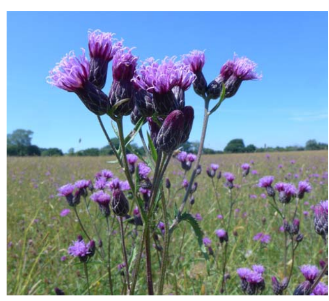
Serratula tinctoria

suggested that the soil here is acidic. In a spectacular meadow with sheets of Knapweed ( Centaurea nigra ) and Devil's-bit Scabious and clouds of butterflies, we found a few plants of Bitter-vetch ( Lathyrus linifolius ), Dyer's Greenweed ( Genista tinctoria subsp. tinctoria ) and abundant Saw-wort ( Serratula tinctoria ). Meanwhile the lepidopterists spotted several Purple Hairstreaks fluttering at the tops of oak trees.