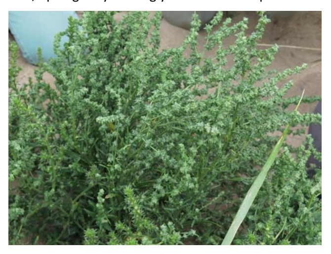
Atriplex littoralis

We then ventured into the dense Sea Couch ( Elytrigia atherica ) - dominated saltmarsh where we met the recording group who had just found 20 large flowering/fruiting plants of Slender Hare's-ear ( Bupleurum tenuissimum ) in the tall dense mass of Sea Couch. This was rather surprising, as this slim, hard-to-spot plant is usually found at this locality on thin, open grassy & shingly substrates and paths.