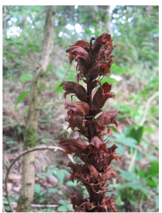
Orobanche rapum-genistae

March 2019 will include a session on them and provide future access to them for members. Sorbus devoniensis is well recorded in VC4 but its area of distribution seems to stop at the border with VC5 except for a couple of old records. We decided to update those records from Bury down towards Dulverton, first with the hedgerow records and secondly with those on edge of small copses. The day started well with both objectives achieved, so we made a car journey to a site over near Brushford. This was a search for the elusive and declining Greater Broomrape (Orobanche rapum-genistae). The first possible area seemed to have been partly cleared and although some Gorse remained we searched without success. The second site did not look promising, overgrown somewhat with shrubs and brambles, so we sat and had lunch, both of us thinking the same thing, "time to call it a day". But refreshed by lunch we spotted the tall spikes of Greater Broomrape just 20-30 yards from where we had been sitting! We only found 4 spikes in all, equally spread under Gorse and Broom. The last record here had been in 1996, so this was a red letter day indeed. August continued hot and it was a little hard to know where to go next with large swathes of brown vegetation in the fields.