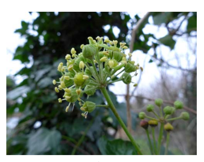
Hedera helix