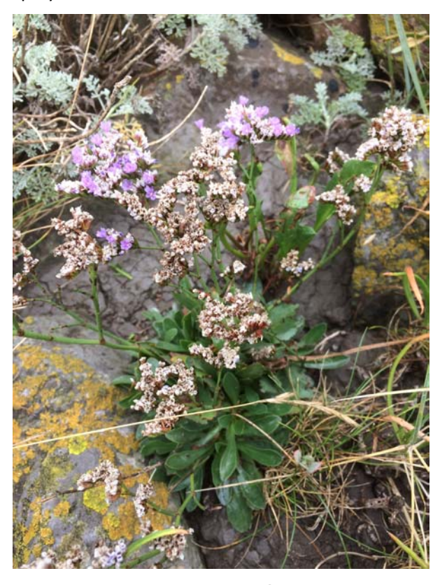
Limonium binervosum

leaf is crushed. The scent of Stone Parsley has been described as 'petrol and spice'! A distinguished plant, characteristic of this part of the Bristol Channel coast, was found by both groups near the river — Sea Clover ( Trifolium squamosum ) had been completely shrivelled in the drought, but the almost-spiny heads were still distinctive.