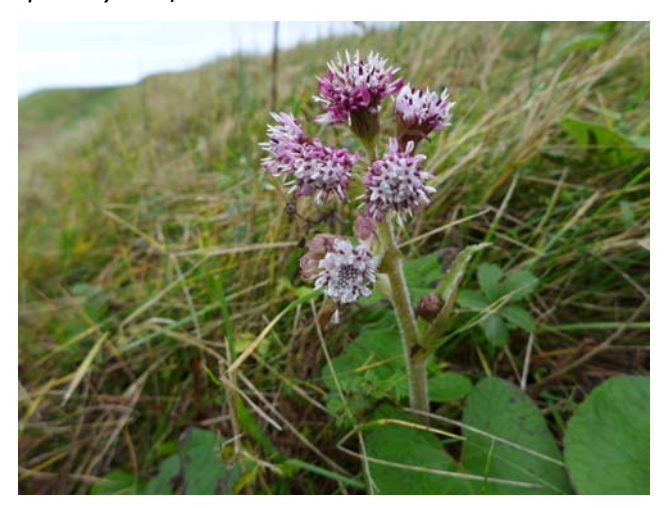
Petasites fragrans

( Urtica dioica ), and soon added Sea Radish ( Raphanus raphanistrum subsp. maritimus ), Bramble ( Rubus ulmifolius ), Annual Mercury ( Mercurialis annuus ) and a huge Hogweed ( Heracleum sphondylium ).