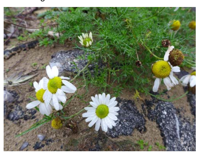
Tripleurospermum maritimum

Out of time, we headed back to Bay View Café on the seafront for tea and cakes. Altogether we had recorded 74 species in flower, which in the end was the 9<sup>th</sup> longest list submitted to the BSBI