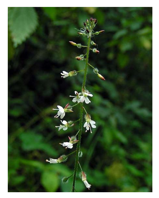
Circaea lutetiana July 26, 2005 Mosel, Germany

The first plant is the extravagantly named but humble Circaea lutetiana , Enchanter's-nightshade.