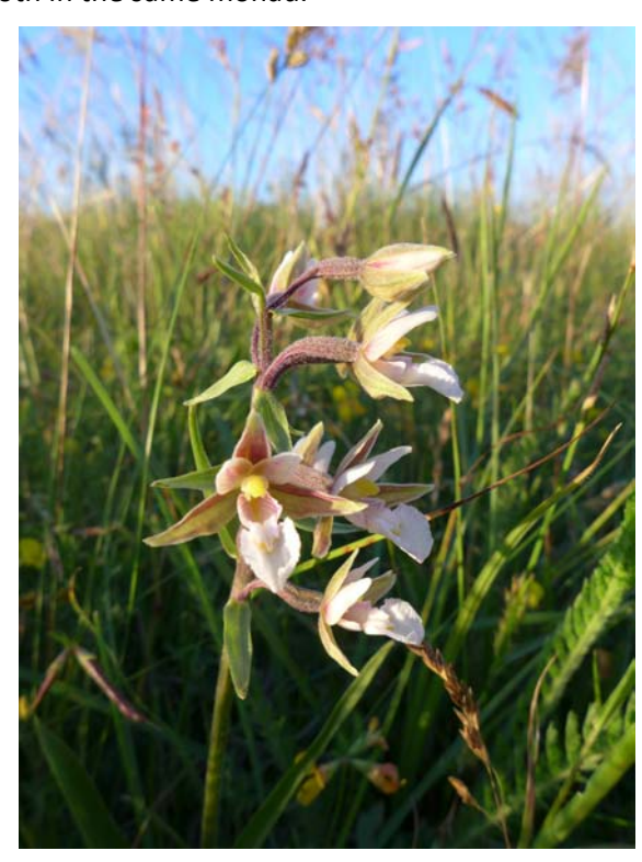
Epipactis palustris

Fifteen members joined Bob Corns of Natural England and the Head Greenkeeper of Burnham & Berrow Golf Course for a warm and sunny evening walk at Berrow Dunes. After no rain for several weeks, the dune vegetation was scorched and frazzled, but despite their disappointingly withered state, it was good to see many Lizard Orchids (Himantoglossum hircinum) on several different dunes. Another target species, Sea Bindweed (Calystegia soldanella) was soon relocated in a hollow near the number "3" sign, but was also found in flower on a dune towards the clubhouse, where Bob had seen it years before. Berrow Dunes is now the only known site in Somerset for this species, so it was great to find it is still in two locations, albeit both in the same monad.