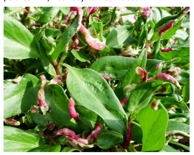
Fig 1 Centranthus ruber with the phsyllid bug Trioza centranthi