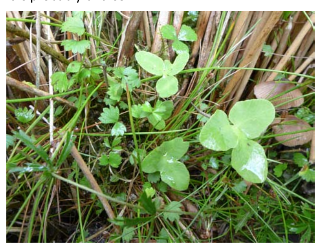
Osmunda regalis

Returning to our target square, we walked along a track between the curious tumps constructed during the Second World War as a bombing decoy to protect Bristol. On one of these Margaret pointed out the alien blackberry Rubus laciniatus , which was first recorded on Black Down by Mark Kitchen in 1992. On another track we found a further 20 plants: it is probably bird-sown.