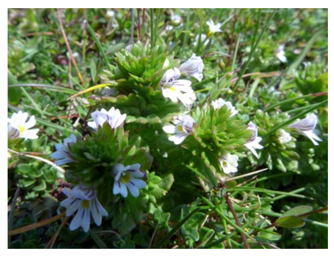
Euphrasia tetraquetra

outcrops offering shade were a perfect spot for lunch, amidst hundreds of Green-winged Orchids and swathes of a striking grass, just coming into flower. Liz soon identified it as French Oat-grass ( Gaudinia fragilis ) which was new to many members. We saw patches of it in several places on the hill. This species is GB Scarce, although not scarce in Somerset. Its status in Britain is uncertain: it is considered to be 'Native or Alien'.