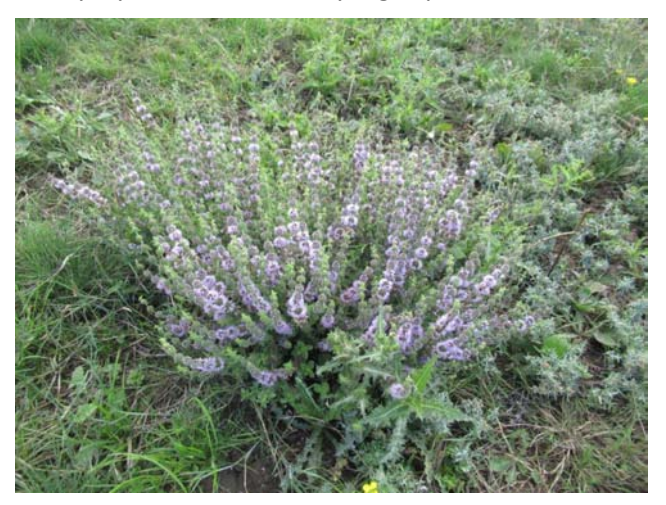
Pennyroyal (Mentha pulegium)

The day was dull overhead and rather chilly, but although many of us shared Peter Hilton's opinion of the 'new' habitat near the lagoons 'I looked hard on those intertidal fields but regrettably no! they were not very interesting', our efforts have made an excellent record of a point in time, as vegetation gradually colonises and develops, while the Pennyroyal find was a really big 'squeak' for VC5!