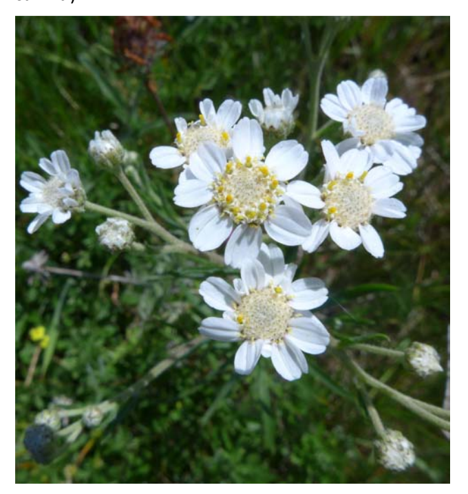
Achillea ptarmica

leporina ) growing with Lesser Spearwort ( Ranunculus flammula ) and Velvet Bent ( Agrostis canina ).