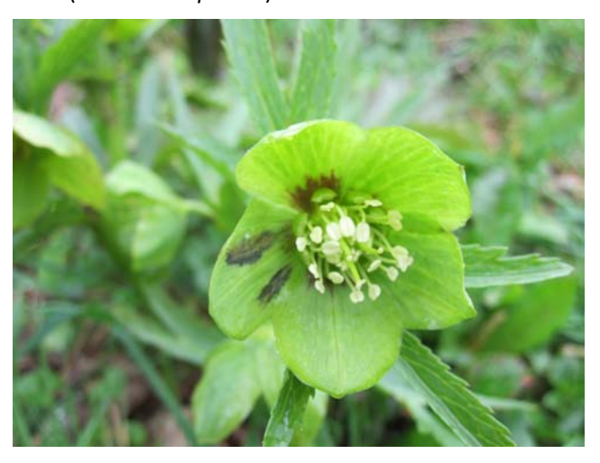
Helleborus viridis subsp. occidentalis