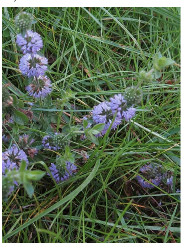
Mentha pulegium

road' (Trenchard Way) near the railway station. On rough ground beside the canal path we noted Balkan Spurge (Euphorbia oblongata) - another new 'quartad' record - while the roadside near the station produced still-flowering plants of Hairy Bird's-foot-trefoil (Lotus subbiflorus) and Hare's-foot Clover (Trifolium arvense), along with other late flowerers like Rosebay Willowherb (Chamerion angustifolium), White Campion (Silene latifolia), Wild Carrot (Daucus carota subsp. carota) and Figleaved Goosefoot (Chenopodium ficifolium). A couple of days prior to the meeting one of us had found Corn Knotgrass (Polygonum rurivagum) there, and knotgrass devotees (thin on the ground, admittedly) were delighted to also see Naked Knotgrass (P. denudatum) and Arable Knotgrass (P. agrestinum). Another interesting find was Grassleaved Orache (Atriplex littoralis), still in flower and only the second record of it from ST22.