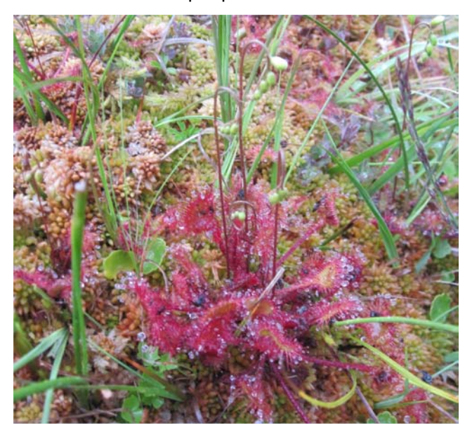
Drosera rotundifolia

Eleven members met at Robbers Bridge car park and walked the short distance to Chalk Water. This fairly wide combe is unusual in that it is a sheep holding area, particularly in the winter when the close proximity to the coast and sheltering hills make it a fairly frost free area for them to take refuge from the bleaker windswept open moor.