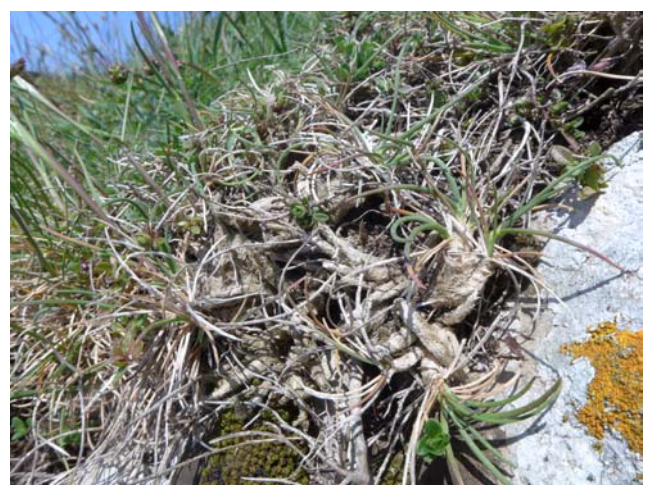
Koeleria vallesiana

The grassland was studded with hundreds of Cowslips (Primula veris) and Green-winged Orchids (Anacamptis morio). In the churchyard, Early Forgetme-not (Myosotis ramosissima) was flowering on the path, alongside Field Forget-me-not (M. arvensis) for comparison. We also found both Common Cornsalad (Valerianella locusta) and Keeled-fruited Cornsalad (V. carinata): it was good to compare the seed shapes. Mouse-ear Hawkweed (Pilosella officinarum) was in flower, later identified as subspecies officinarum by Graham Lavender. A Wall butterfly was an added bonus.