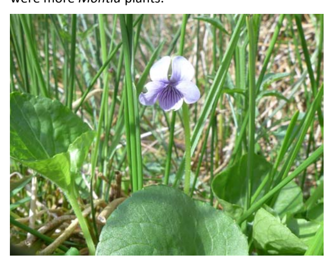
Viola palustris

The roadside vegetation was relatively species-poor; by chance the group was able to obtain permission from the local farmer to survey his land to the west of this minor road. He warned us that the woodland was very wet and dangerous. Initially the farmland was relatively improved and not of much interest. After lunch, things improved and we spent some time in a small but high quality mire. Large patches of Blinks (Montia fontana subsp. chondrosperma) together with Bog Pimpernel (Anagallis tenella), Common Sedge (Carex nigra), Marsh Violet (Viola palustris) and Marsh Pennywort (Hydrocotyle vulgaris) were scattered in the wetter parts. A small pond at the base of the mire sadly was less interesting, however on the margin of the pond were more Montia plants.