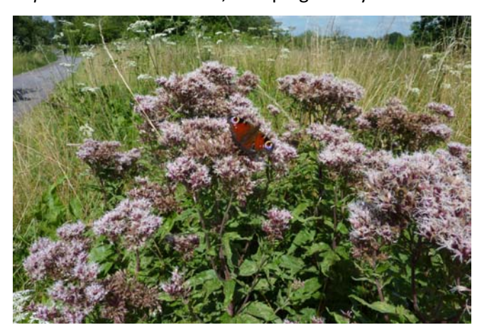
Eupatorium cannabinum, Shapwick Heath

Plant number two is the common wetland species Eupatorium cannabinum , Hemp-agrimony.