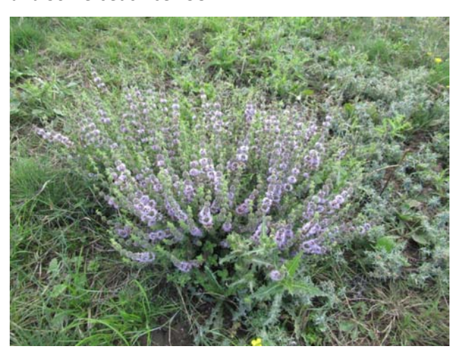
Mentha pulegium ©Ro FitzGerald

Hieracium umbellatum subsp. bichlorophyllum (Umbellate Hawkweed) – Nutcombe Bottom (SS97764238), 8 Oct, 150+ plants on steep bank opposite car park entrance, stretching for some 100 yds, GEL, VC5. First record for the subspecies in VC5 and Somerset since 1981.