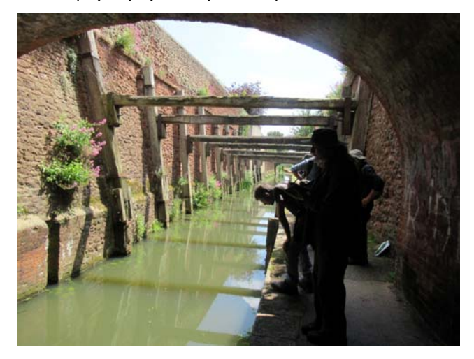
Urban Botany

aquatics from the bank, including Spiked Water-milfoil ( Myriophyllum spicatum ).