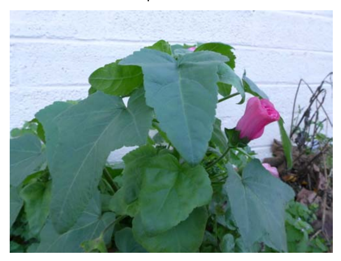
Malva trimestris

*Malva trimestris (Royal Mallow) – Bath, South Twerton (ST73046429), 13 Nov, 1 plant at edge of track to playing field, HJC & DEG, VC6. Third record for VC6 and first since pre-2000.