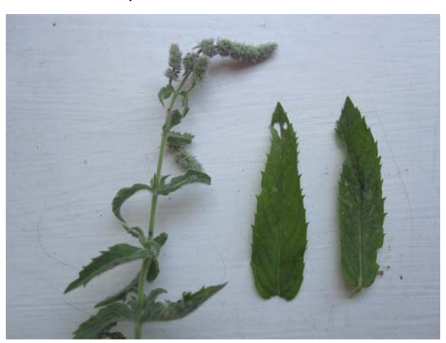
Mentha x villosonervata

The highlight however was the Marsh Fragrant orchid (Gymnadenia densiflora) which we had found at peak flowering time. A voucher specimen now resides in Taunton herbarium. Another notable July day featured a trip to Haddon Moor Butterfly Nature reserve at Upton. Although well recorded during the last few years we were still able to locate some unexpected plants which must have been previously overlooked. Pale Butterwort (Pinguicula lusitanica) delighted us in flower (not recorded since the Green brothers in 2003), but highlights new to the site were Cornish Moneywort (Sibthorpia europaea) and Ivy-leaved Bellflower (Wahlenbergia hederacea). Even in this relatively well recorded small site we increased the total records from 121 to 145, proving that focused update efforts can be well worth it.