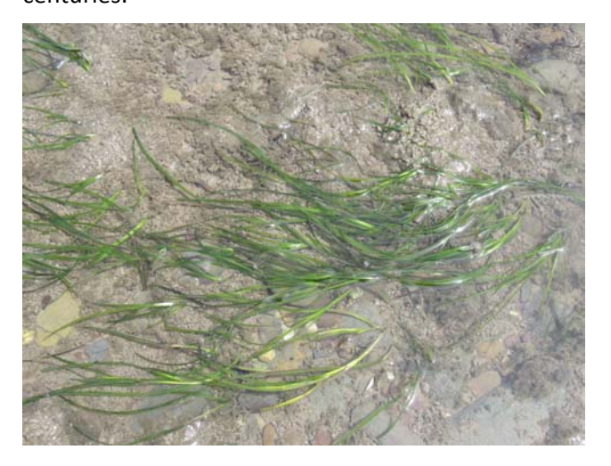
Zostera marina

We must hope that our precious Stolford population will persist. It is 'upstream' of the works at Hinkley Point, which are extending west not east, but new management policy for the shingle bar — future storm breaches are not to be 'mended' — may alter the land habitat which has been the source of the apparently essential fresh-water seepages for centuries.